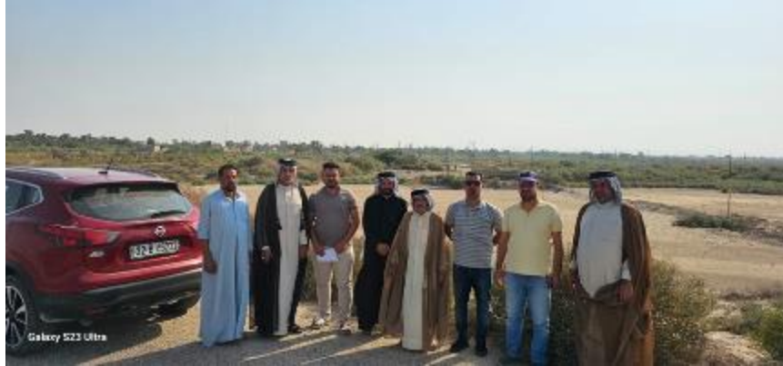
Public Consultations at AL-SAFHA Village