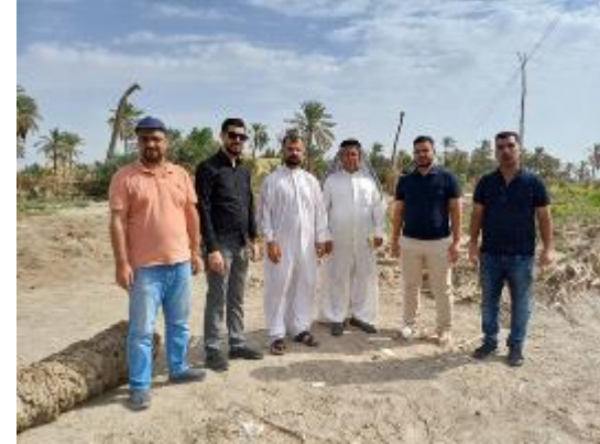
Public Consultations at ALBU HAMDAN Village