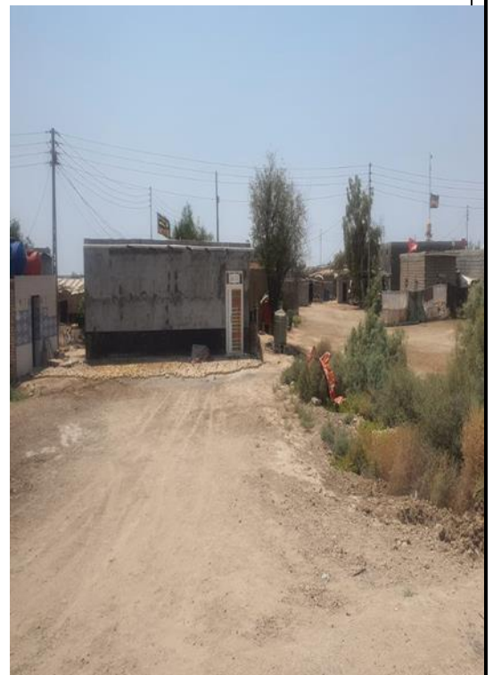
Roads in ALBU SHOURA