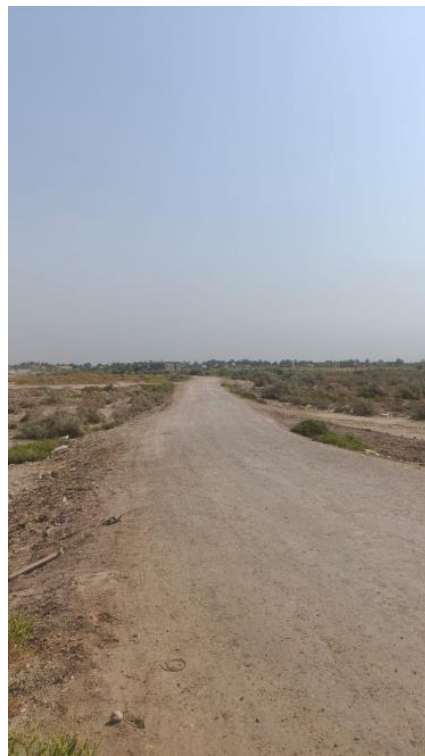
Roads in ALTROOM