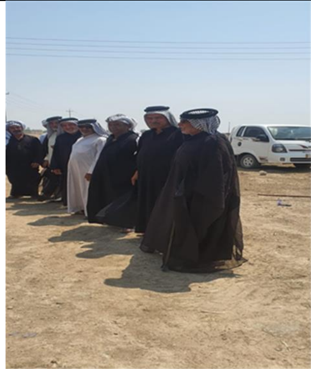
Public Consultations at ALBU SHOURA Village