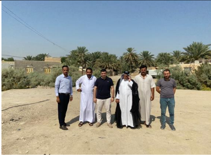
Public Consultations at ALTROOM Village