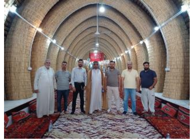
Public Consultations at AL-DABAT Village