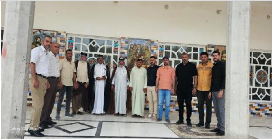
Public Consultations at ABU HEIFA Village