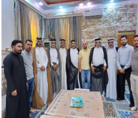
Public Consultations at ALBU HAMIDI Village