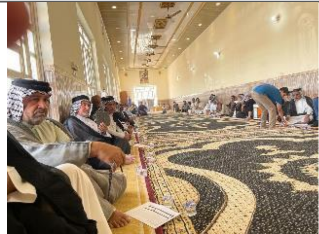
Public Consultations at AL-GARYAFIYA Village