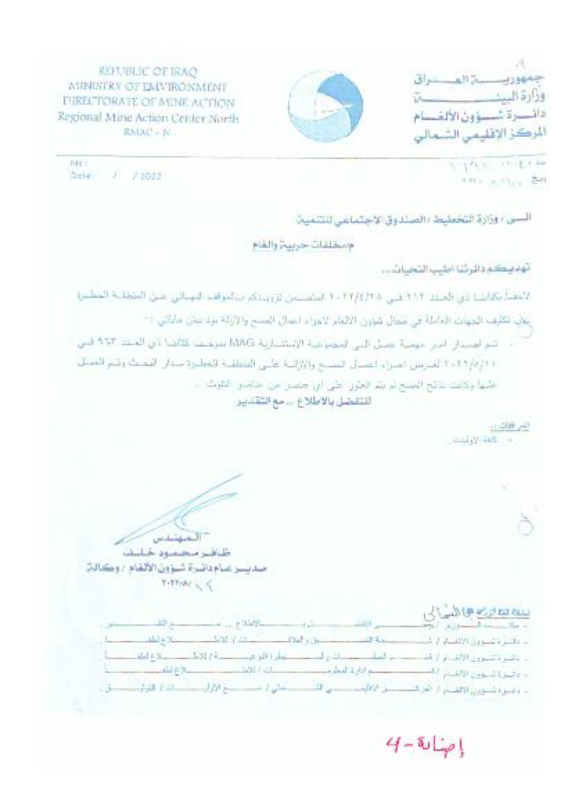
Page 38 of 47