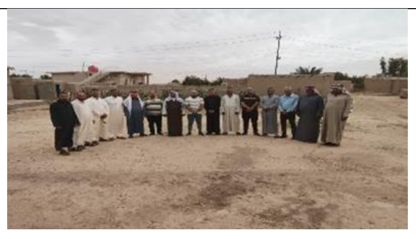
Public consultations at Tel benat alqudim village