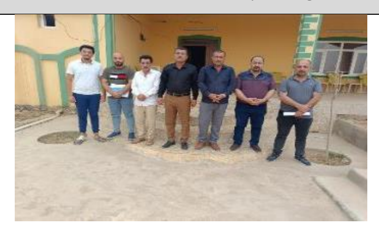
Public Consultations at Ruska Village