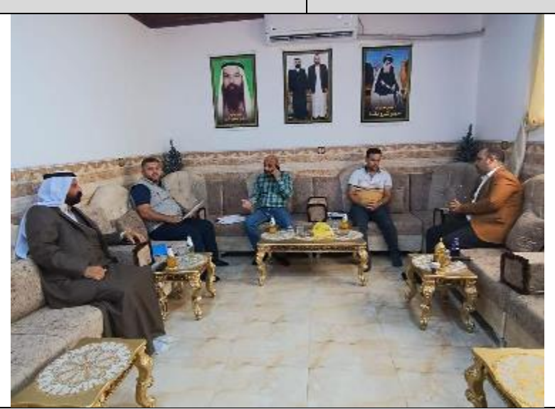
Public consultations at mojamaa Al-Qahtania village