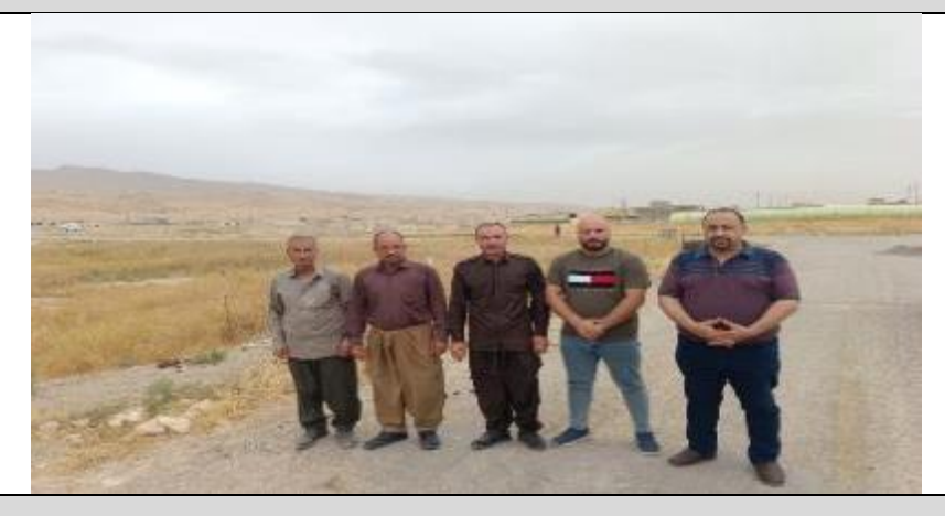
Public Consultations at Al-Magnonia Village