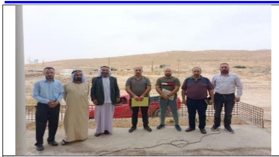
Public consultations at Jedalah village