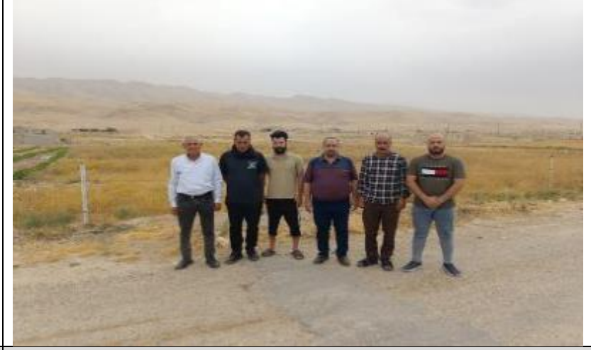
Public consultations at Al-Hayali village