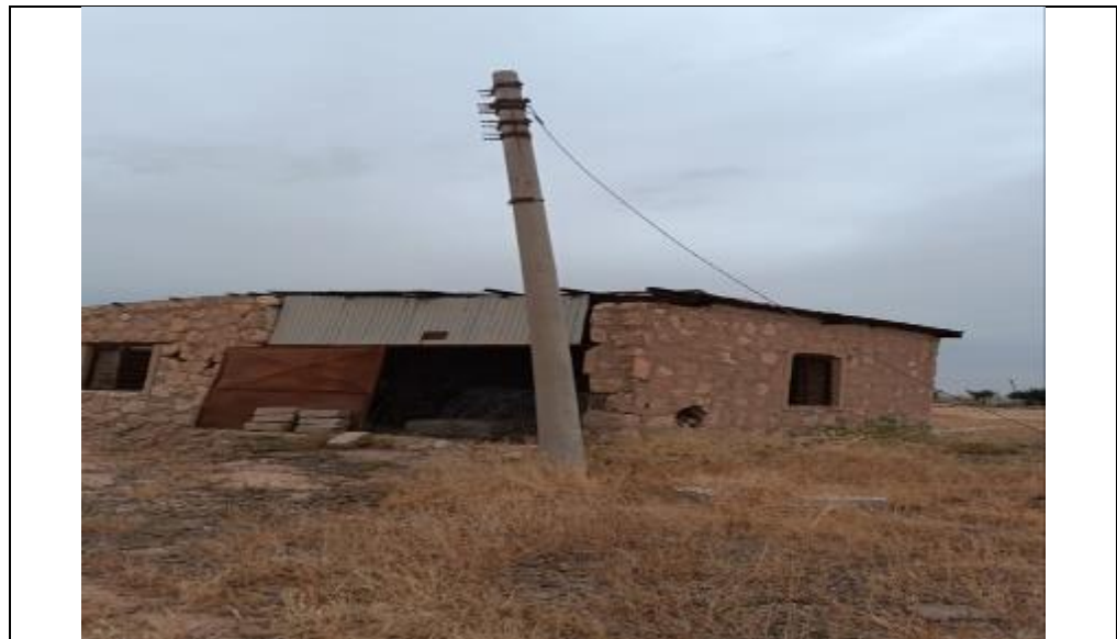
SEBAYA AZIZE AGA

The subprojects will improve the electricity distribution networks, increase the flexibility of providing electricity and therefore providing electricity to schools and other simple daily activities, and will support mitigating the effects of war to attract displaced citizens to their villages.