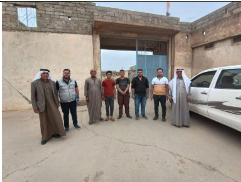
Public Consultations at SEBAYA AZIZE AGA Village