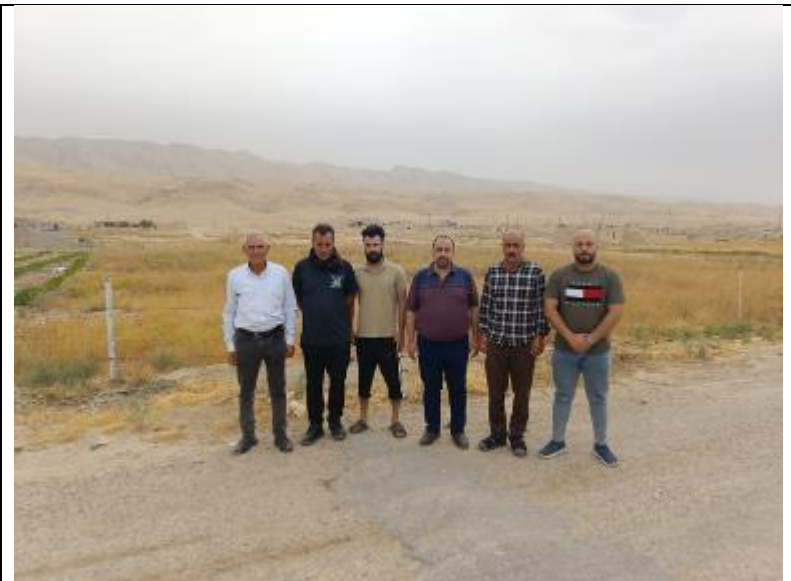
Public Consultations at AL-HAYALI Village