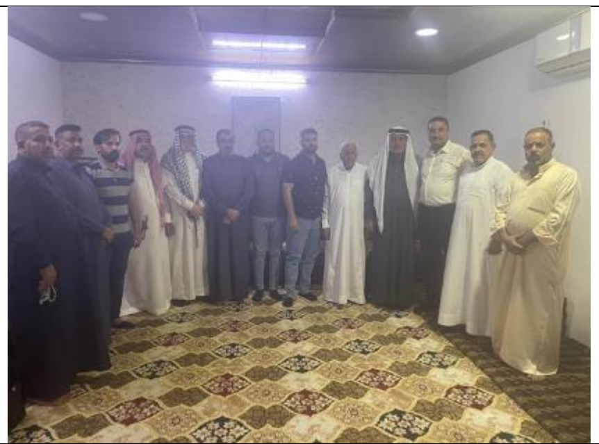
Public consultations at ALBU SAIF village