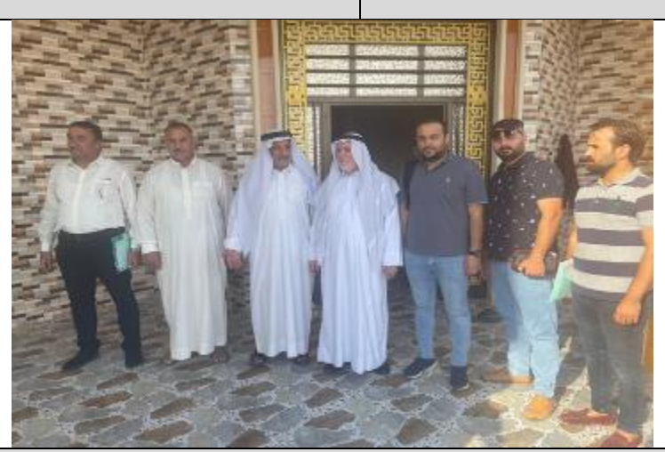
Public consultations at AIJHILA village