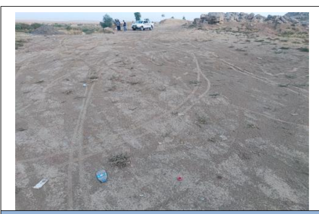
Roads in AL-SAFINA

The area adjacent to these subprojects' sites are characterized as rural residential and semi desertic to agricultural in some area. There are no protected areas or endangered species (there is no critical or high biodiversity values that might be affected) in the vicinity of the sites. There are no close sensitive receptors located to the subprojects site. The subprojects will improve the transportation infrastructure in these villages by providing asphalt surface to facilitate transport for local communities and road users. Moreover, the road will help the students to go to their schools easily. It important to mention that these roads are within the villages as a network, therefore the other roads can be used as alternative roads.