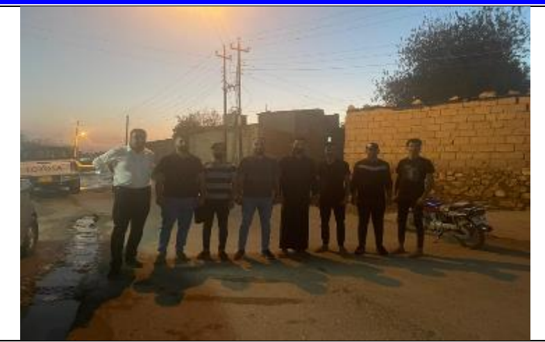
Public consultations at AL-SAFINA village