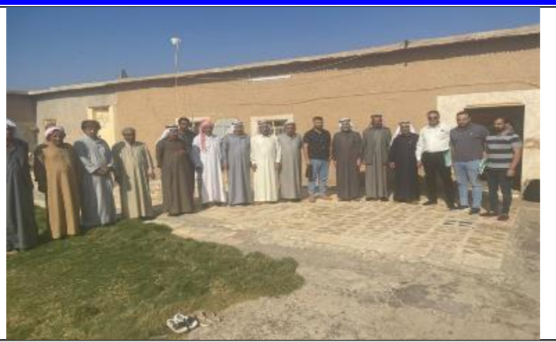
Public consultations at BEJWANIA OULYA village