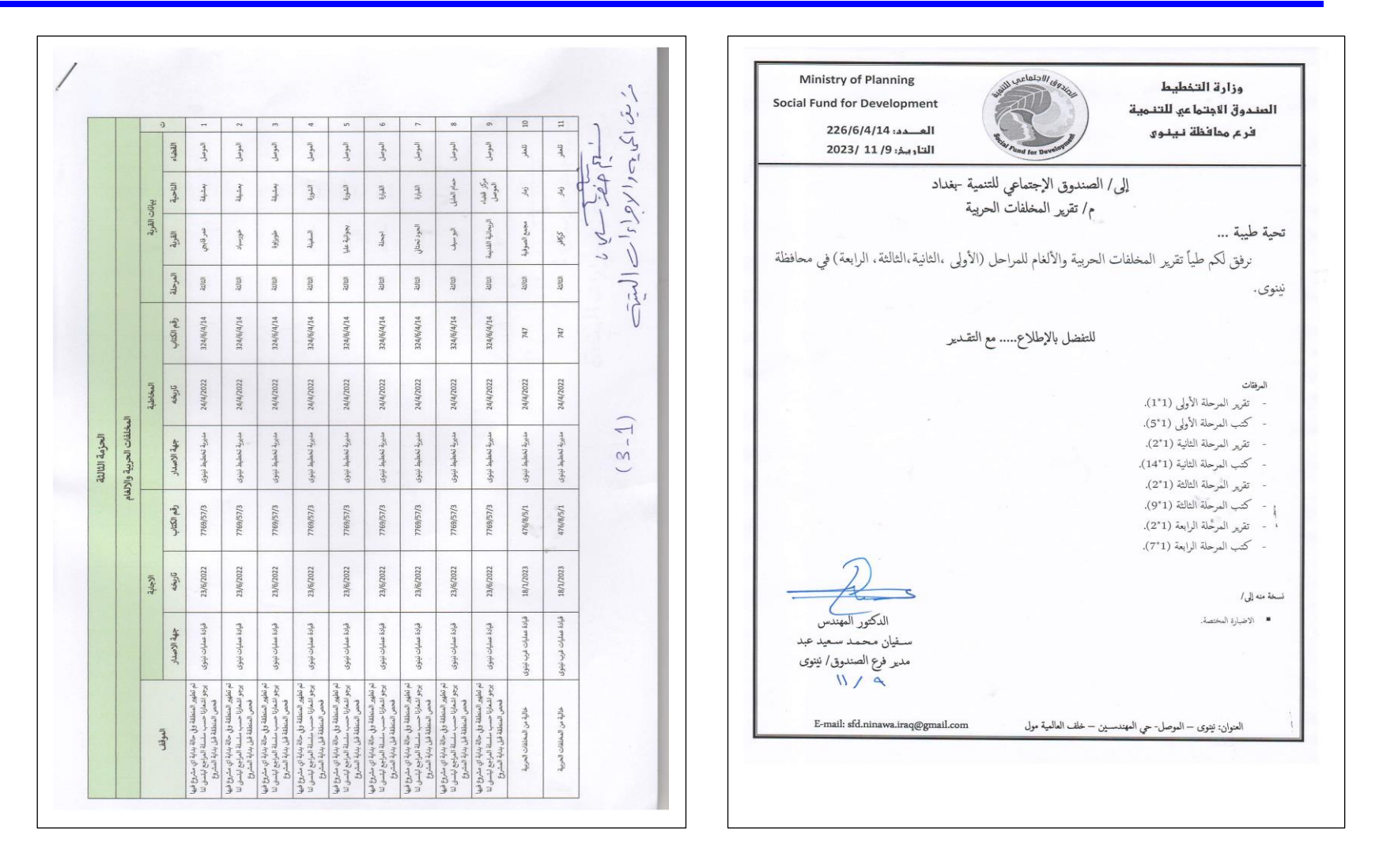
Annex (4): Letter of clearance from UXO