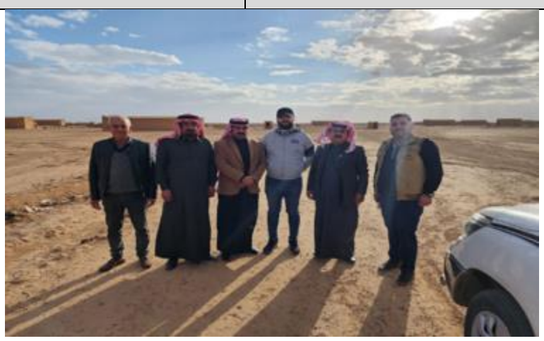
Public consultations at MUJAMAA AL-SAKKAR village