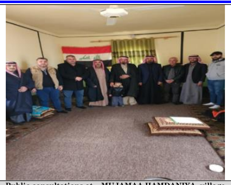
Public consultations at MUJAMAA HAMDANIYA village