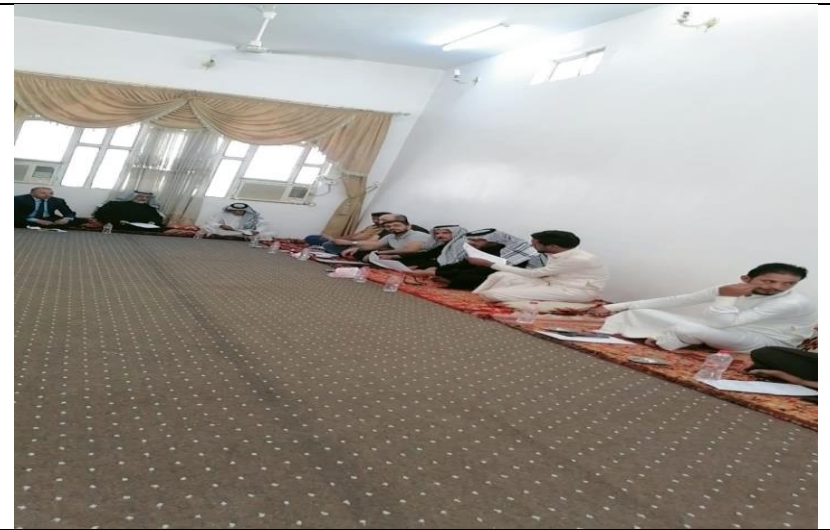
Public Consultations at Agun Village