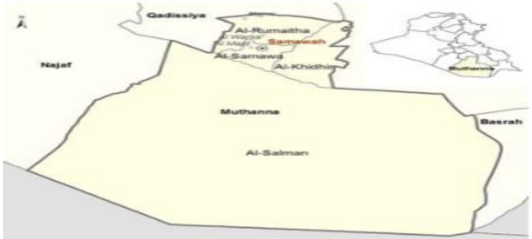
Figure 1: Project Location

The area adjacent to these subprojects' sites are characterized as rural residential and semi deserts to agricultural in some area. There are no protected areas or endangered species (there is no critical or high biodiversity values that might be affected) in the vicinity of the sites. There are no close sensitive receptors located to the subprojects site. The subprojects will improve the transportation infrastructure in these villages by providing asphalt surface to facilitate transport for local communities and road users. Moreover, the road will help the students to go to their schools easily. It important to mention that these roads are within the villages as a network, therefore the other roads can be used as alternative roads.