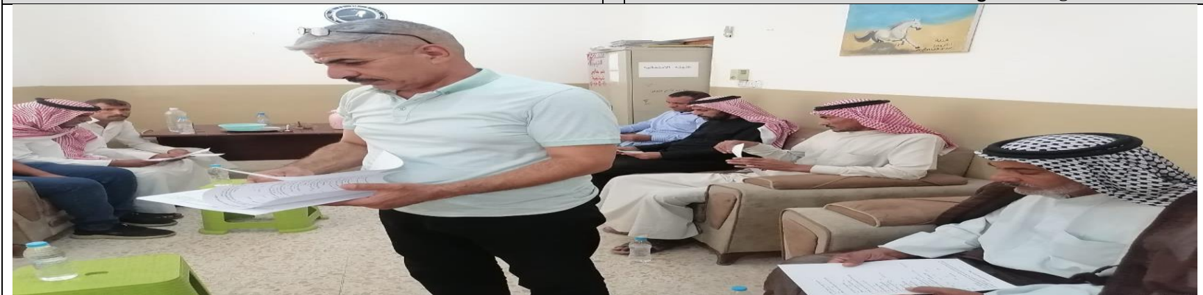
Public Consultations at Al-mumlaha Village