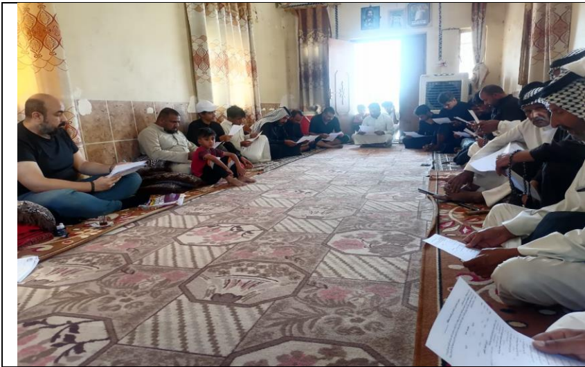
Public Consultations at Ata Allah Village