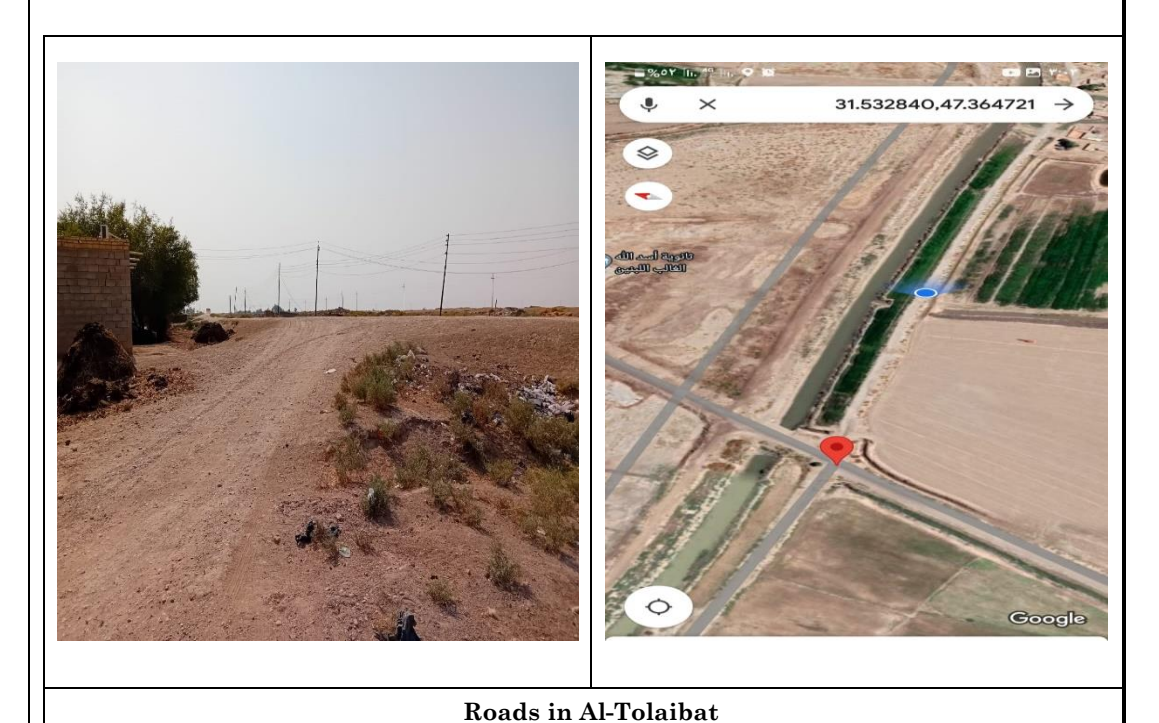
Page 5 of 44

The area adjacent to these subprojects' sites are characterized as rural residential and semi desertic to agricultural in some area. There are no protected areas or endangered species (there is no critical or high biodiversity values that might be affected) in the vicinity of the sites. There are no close sensitive receptors located to the subprojects site. The subprojects will improve the transportation infrastructure in these villages by providing asphalt surface to facilitate transport for local communities and road users. Moreover, the road will help the students to go to their schools easily. It important to mention that these roads are within the villages as a network, therefore the other roads can be used as alternative roads.