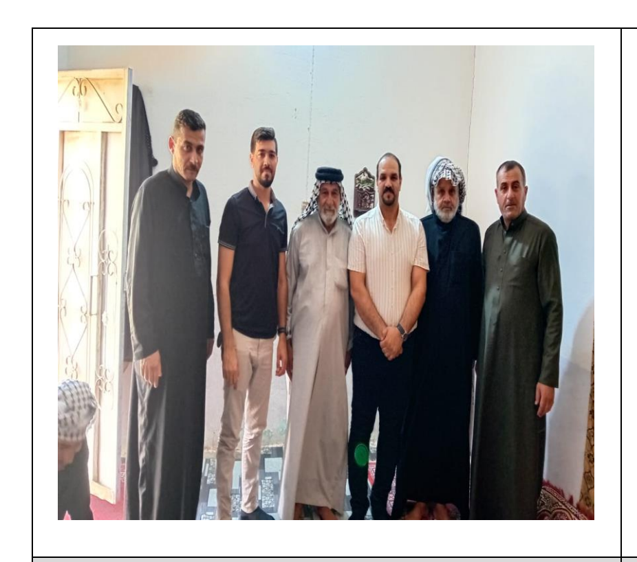
Public Consultations at Al-Tolaibat Village