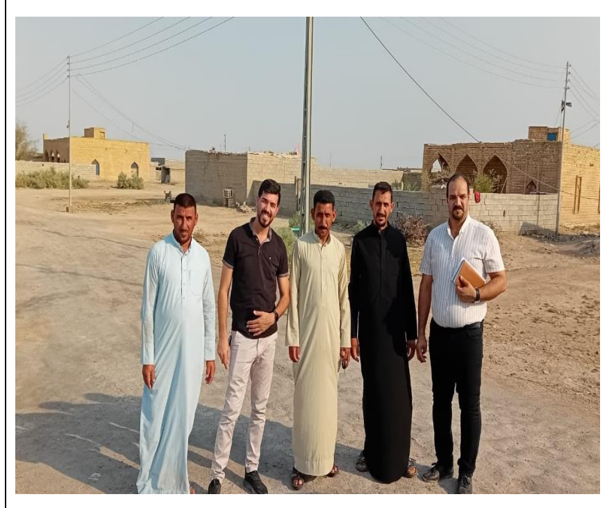
Public Consultations at Al-Sakhra Village