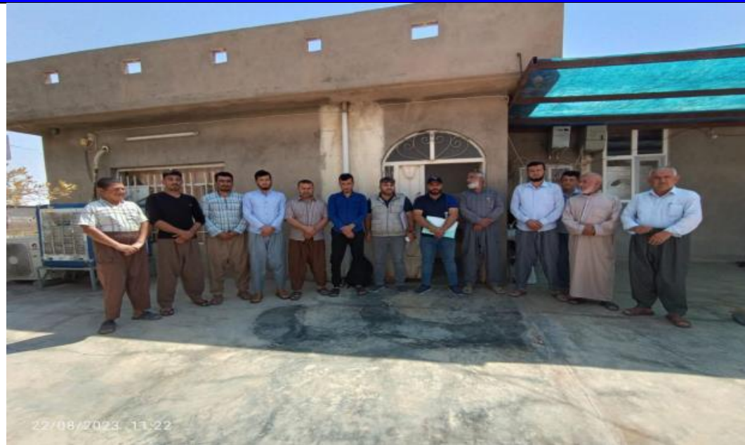
Public Consultations at GYURKA Village