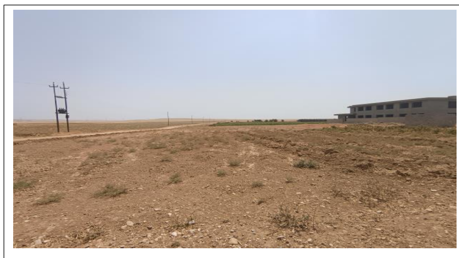
Figure 1: Project area

The area adjacent to the subproject site (5-A football playground) is characterized as rural residential and semi desertic in some areas. The subproject is located within a residential part of the area. There are no protected areas or threatened species (there are no critical or high biodiversity values that might be affected) in the vicinity of the site. There are no close sensitive receptors located to the subprojects site. The subproject is expected to result in significant socio-economic benefits for the local community and surrounding areas as it will enhance self-esteem and the ability to value each person's own worth through a happy, caring, enriching and secure environment. Also, to