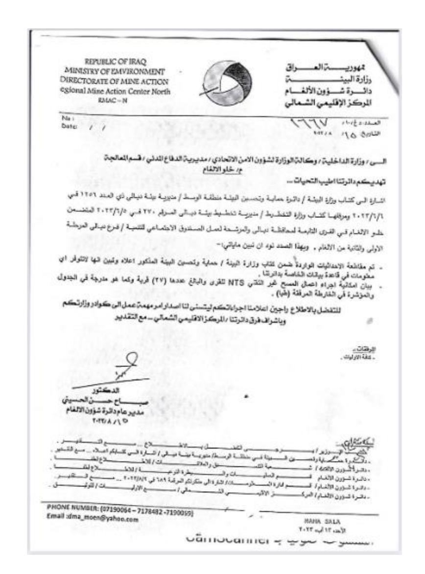
Annex (5): Contractor's Responsibilities (Arabic) مسئوليات المقاول