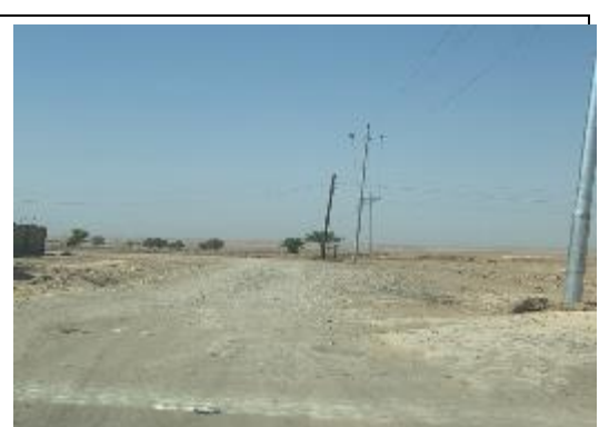
Roads in Al-Qalaa