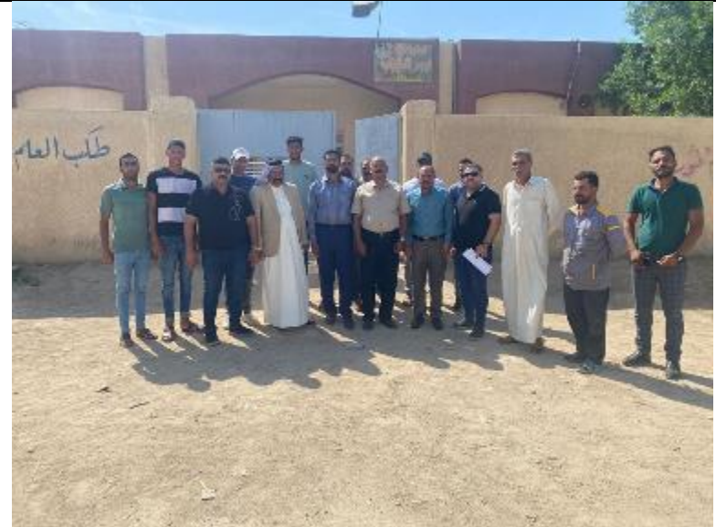
Public Consultations at UM-AL-BSAL Village