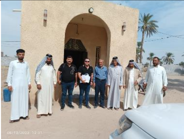
Public Consultations at AL-SALIHIA AL-THABITIA Village