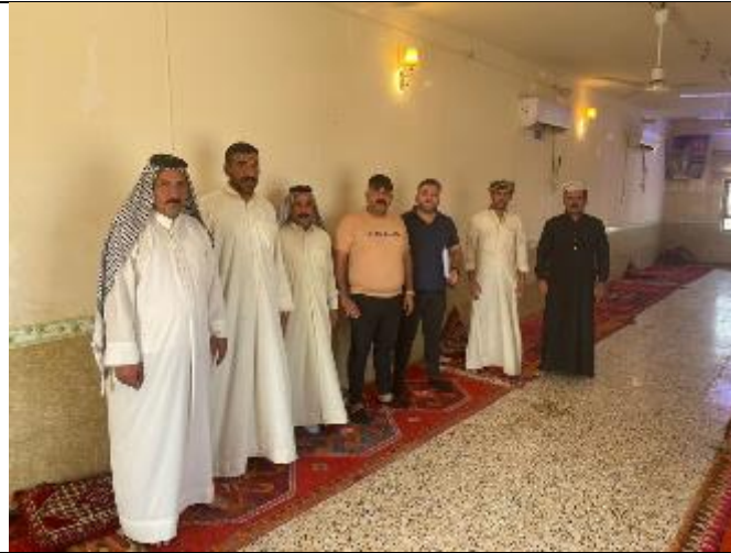
Public Consultations at ALBU RABAH Village