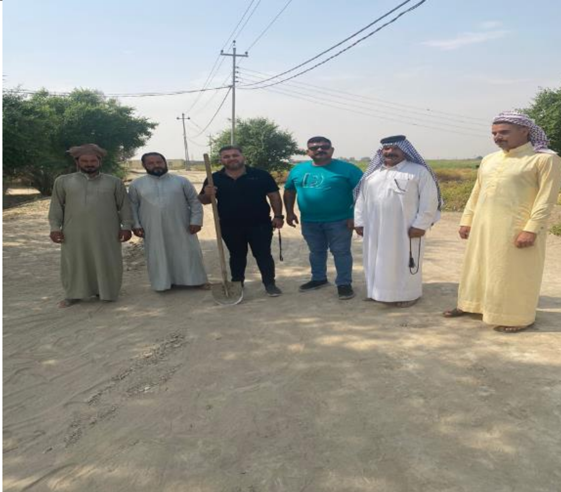
Public Consultations at KRITY Village