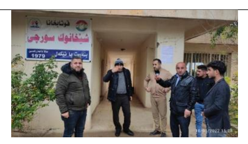
Public Consultations at KOWNAPAK Village