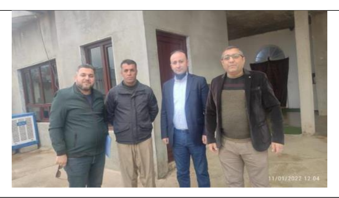
Public Consultations at DOKUNDAN Village