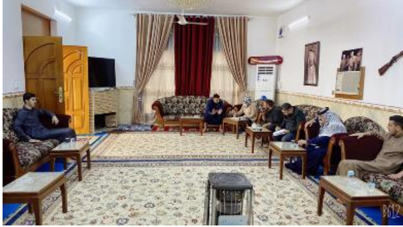
Public Consultations at MAJEED AL-NASSER Village