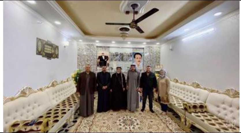
Public Consultations at TALIB AL-ALI Village