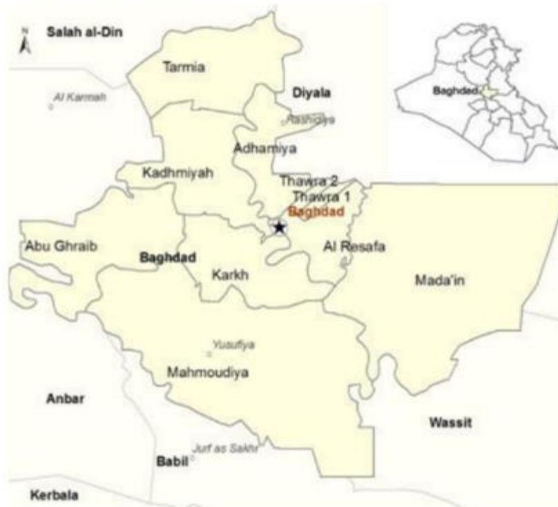
Figure 1: Project Location

The area adjacent to these subprojects' sites are characterized as rural residential and semi desertic to agricultural in some area. There are no protected areas or endangered species (there is no critical or high biodiversity values that might be affected) in the vicinity of the sites. There are no close sensitive receptors located to the subprojects site. The subprojects will improve the transportation infrastructure in these villages by providing asphalt surface to facilitate transport for local communities and road users. Moreover, the road will help the students to go to their schools easily. It important to mention that these roads are within the villages as a network, therefore the other roads can be used as alternative roads.