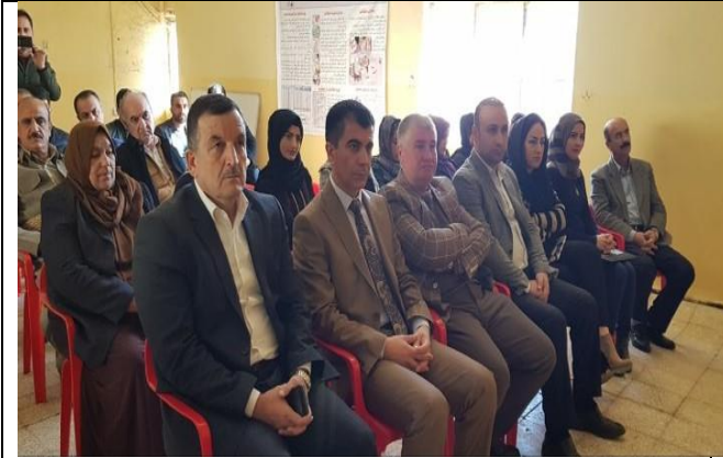
Public Consultations at Batail Village