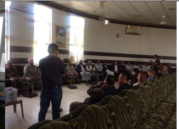
Public Consultations at Isian Village