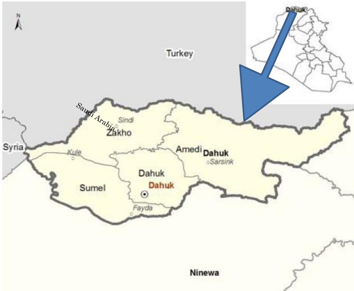
Figure 2 Map of Iraq on the right and Duhok governorate on the left.

These subprojects are located in areas from flat to some hills and valleys. The area adjacent to the subproject sites is characterized as rural residential and semi desertic to agricultural in some area.