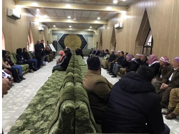
Public Consultations at Singara Village