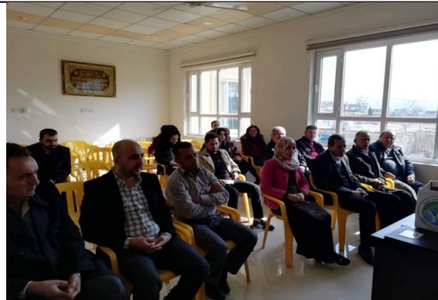
Public Consultations at Mankish Village