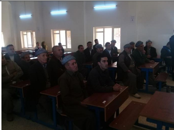
Public Consultations at Broshka Village