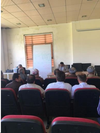
Public Consultations at Alika Village