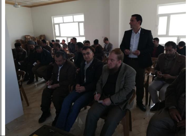
Public Consultations at Kah Laka Village