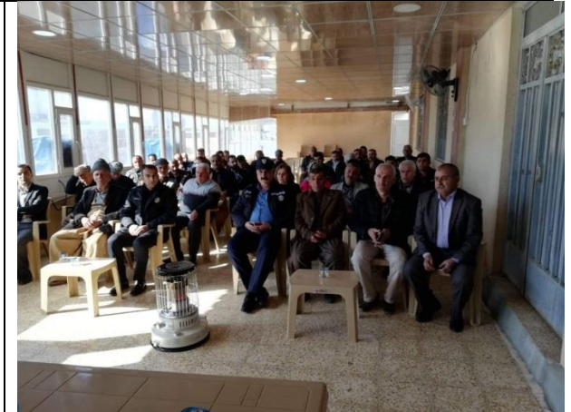
Public Consultations at Sarsank Village