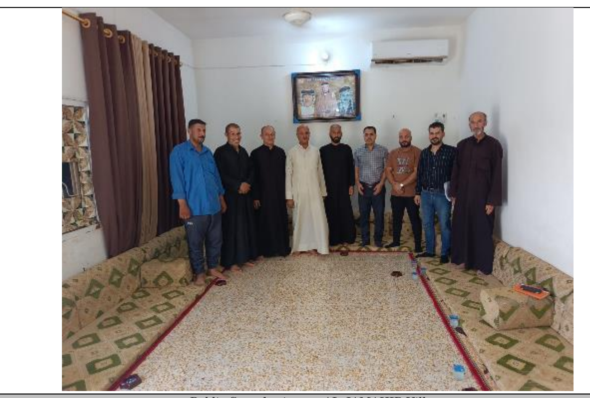
Public Consultations at AL-JAMAHIR Village