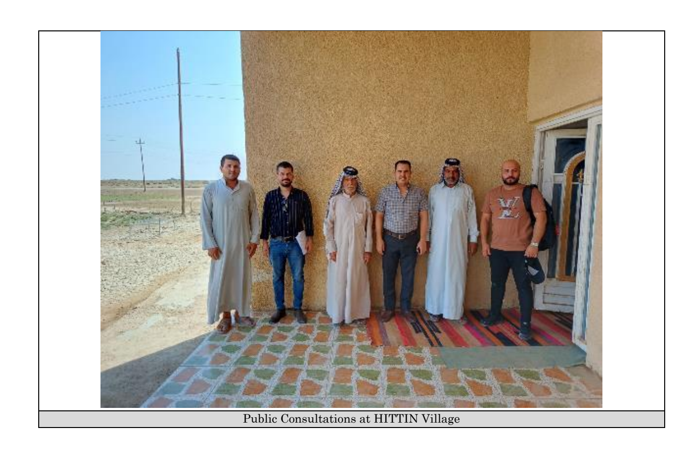
Annex (2): Sample individual interviews for both men and women