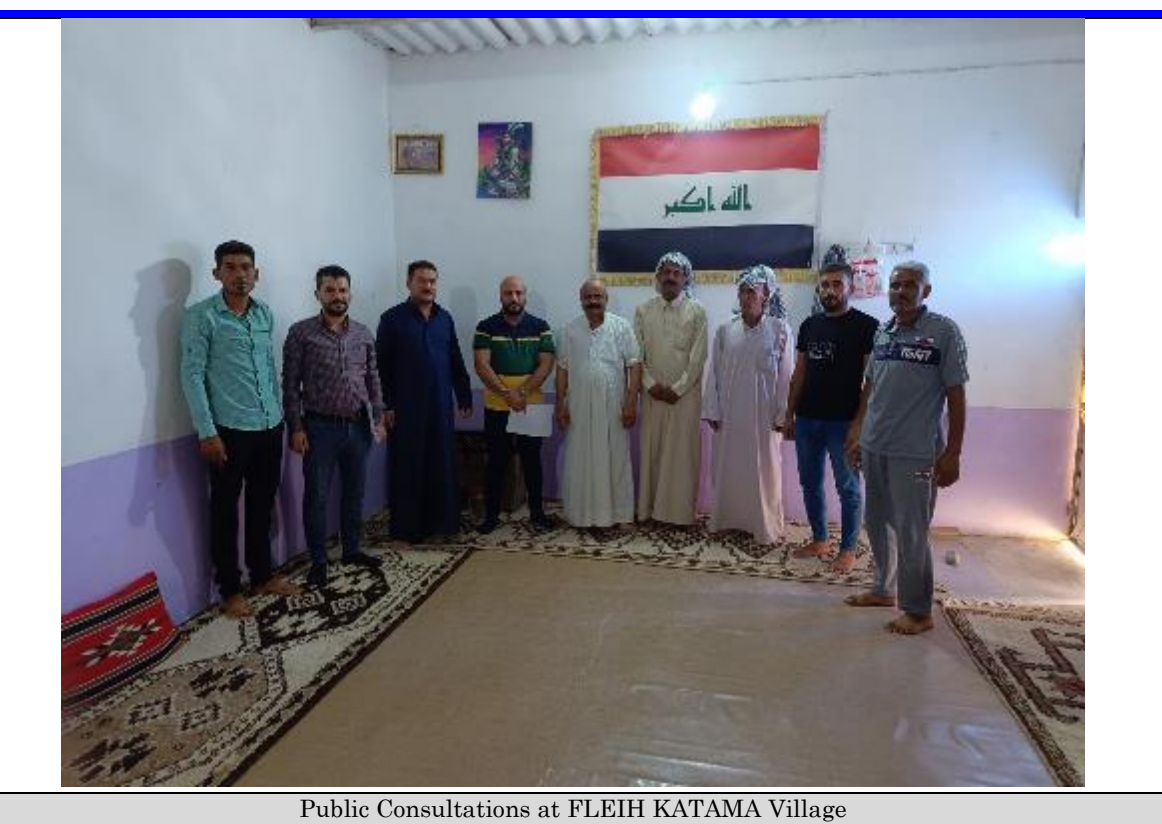
Page 35 of 52