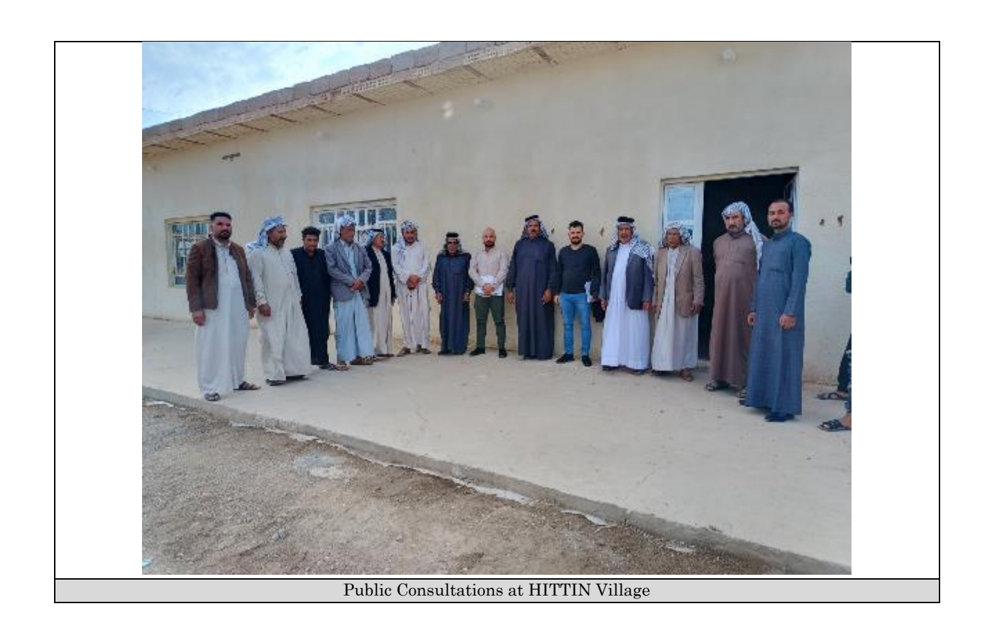
Annex (2): Sample individual interviews for both men and women