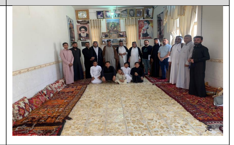
Public Consultations at Al-Shahriya Village