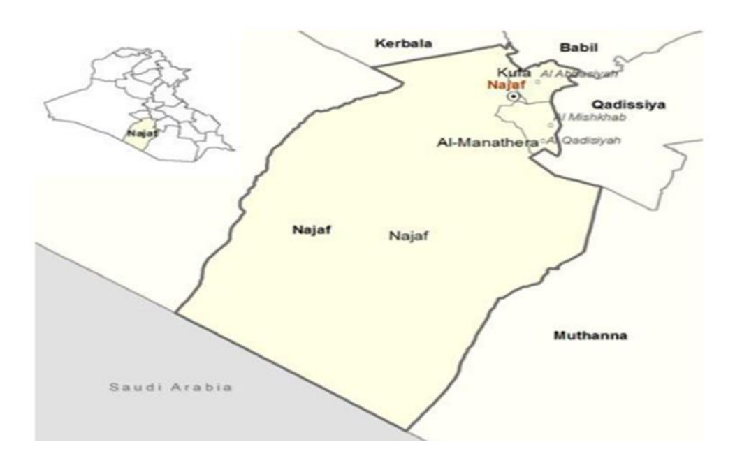
Figure 1: Project Location

The subproject is located in the governorate of AL-NAJAF that is located in southwestern Iraq and borders Saudi-Arabia. Al-Najaf also shares internal boundaries with the governorates of Anbar, Kerbala, Babil, Qadissiya and Muthanna. Desert plains dominate the landscape of the governorate (as shown in figure below).