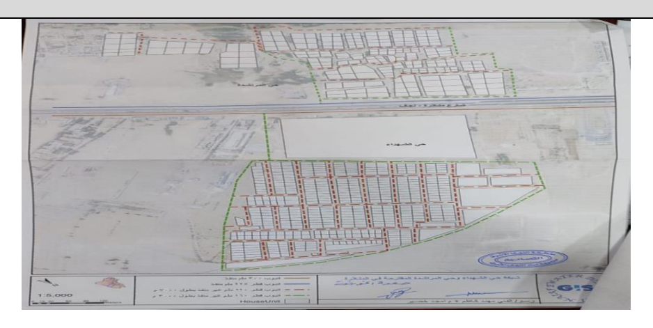
Hasoat Al-Khurang Village / Water Network