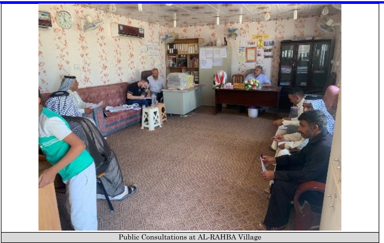
Annex 1: Consultations Photos