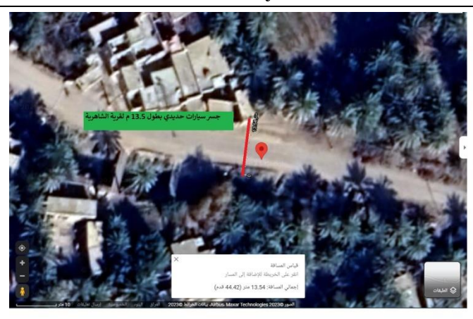
Al-Shahriya / Steel Bridge