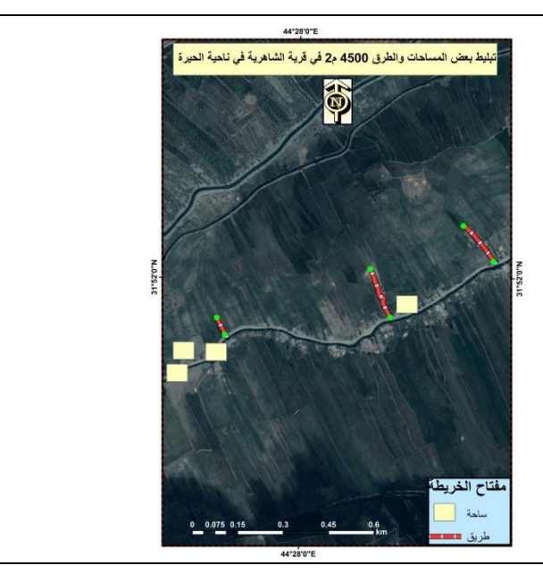
Al-Shahriya / road

communities and road users. Moreover, the road will help the students to go to their schools easily. It important to mention that these roads are within the villages as a network, therefore the other roads can be used as alternative roads.