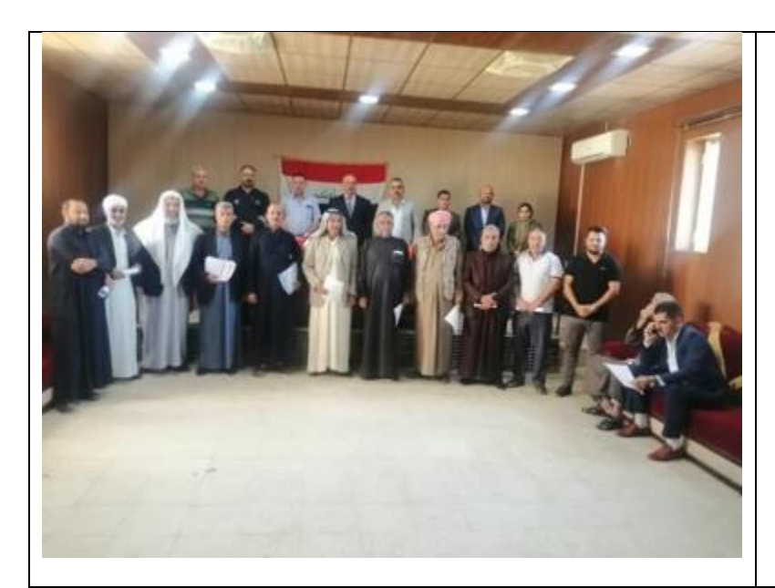
Public Consultations at BALWA Village