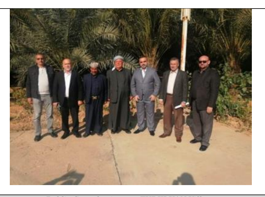
Public Consultations at TURKLUAN Village