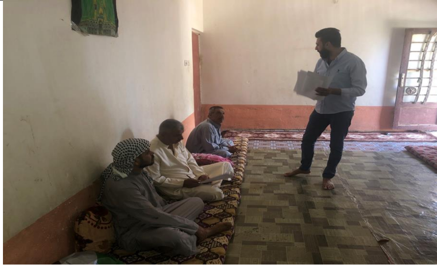
Public Consultations at Al-Sawada 2 Village