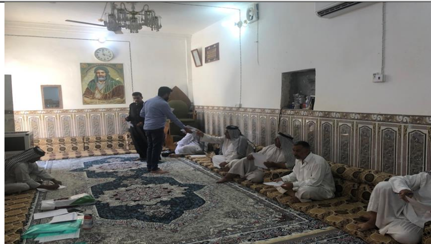
Public Consultations at Al-Boshlash, Village