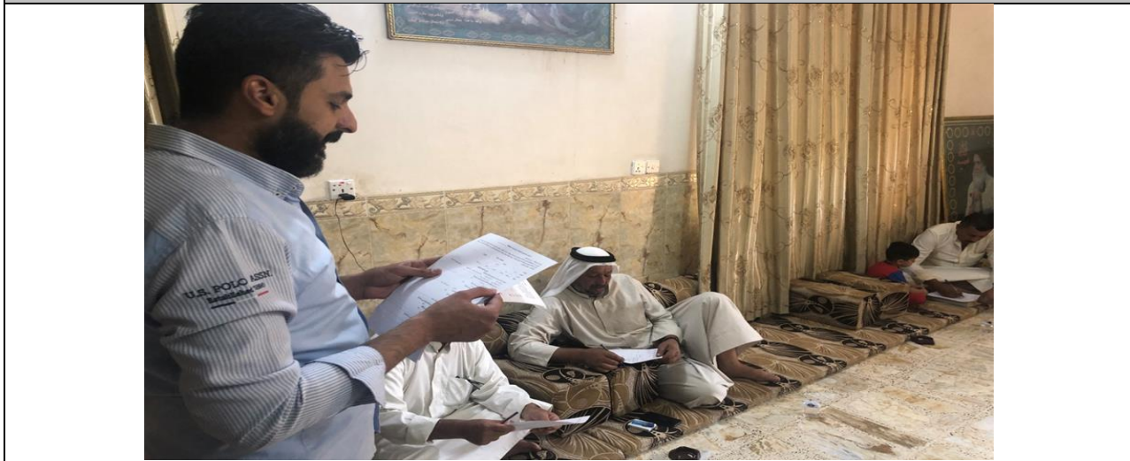
Public Consultations at Al-Sawada 1 Village