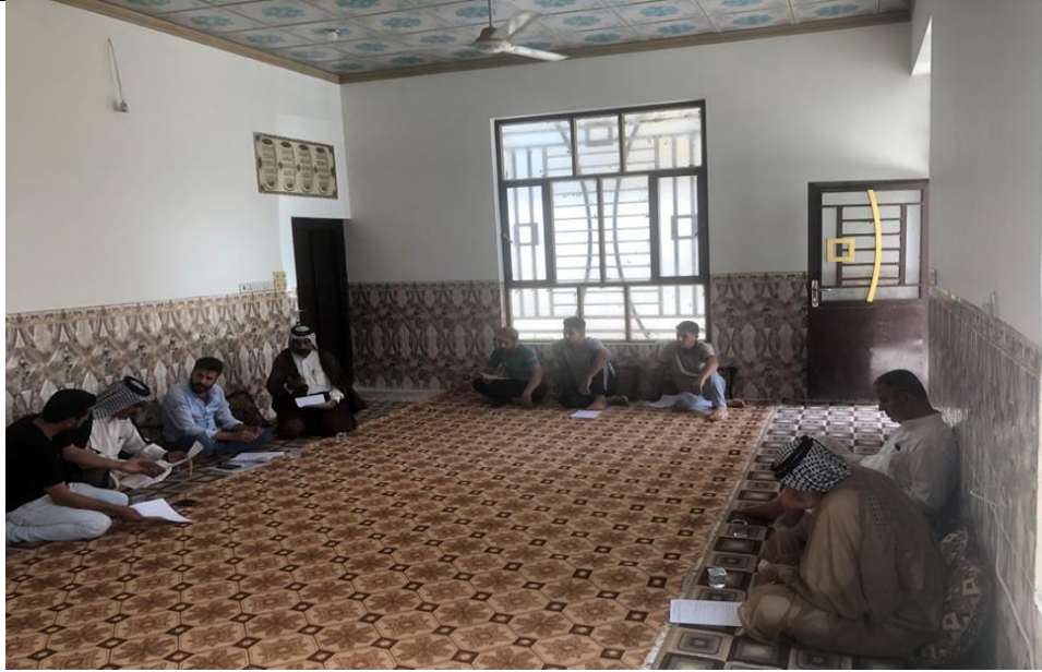
Public Consultations at Al-Dukhanya Al-Gharbya Village