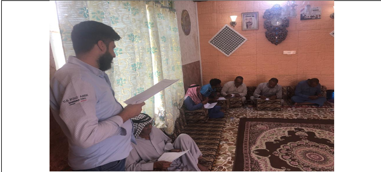
Public Consultations at Haswa Al-Saoud Village