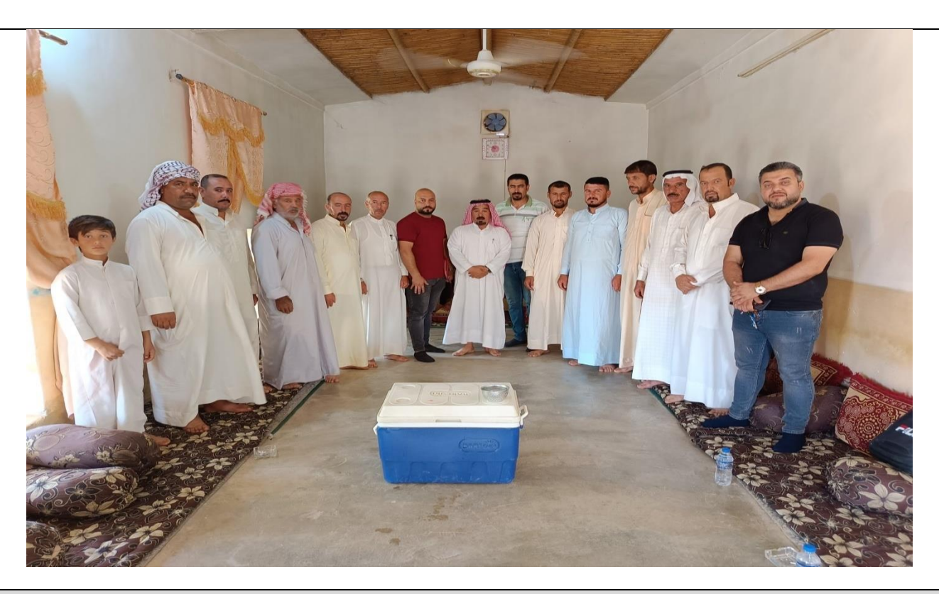
Public Consultations at AL-MAKAM Village