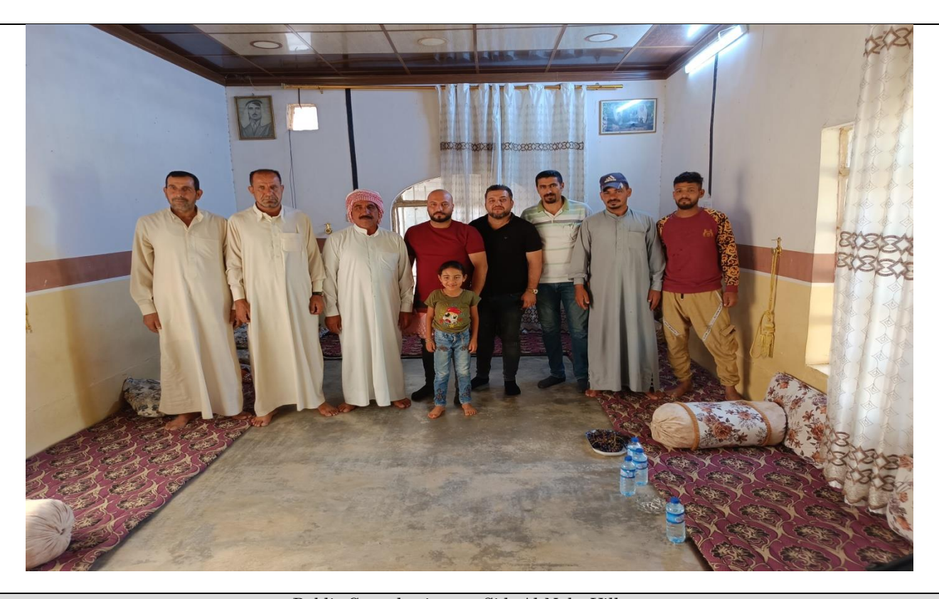
Public Consultations at Sidr Al-Nahr Village