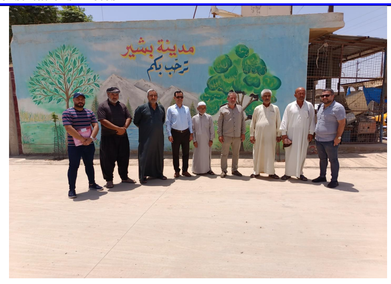
Public Consultations at AL-BASHIR Village