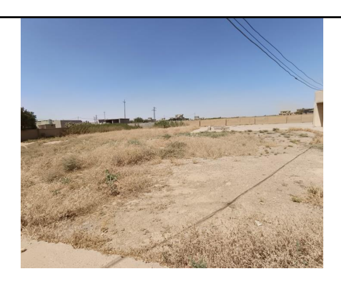
Sidr Al-Nahr /health house