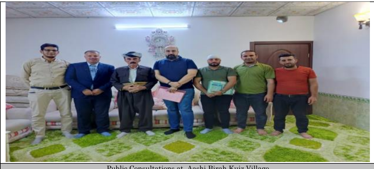
Public Consultations at Aashi Birah Kuiz Village