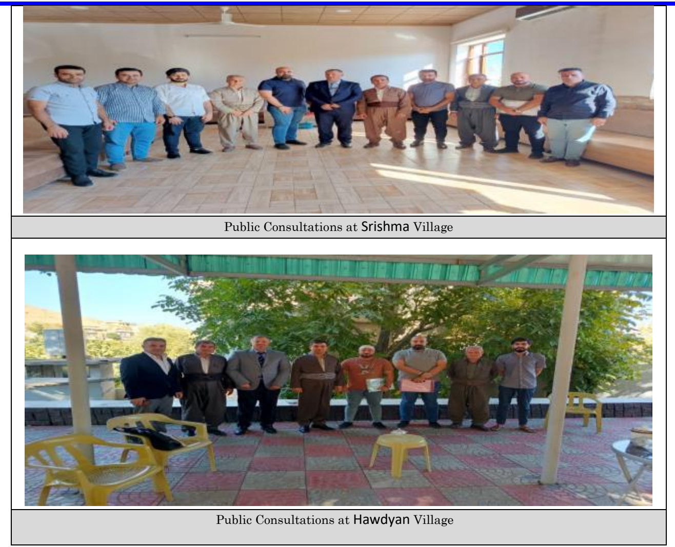
ANNEXES Annex 1: Consultations Photos