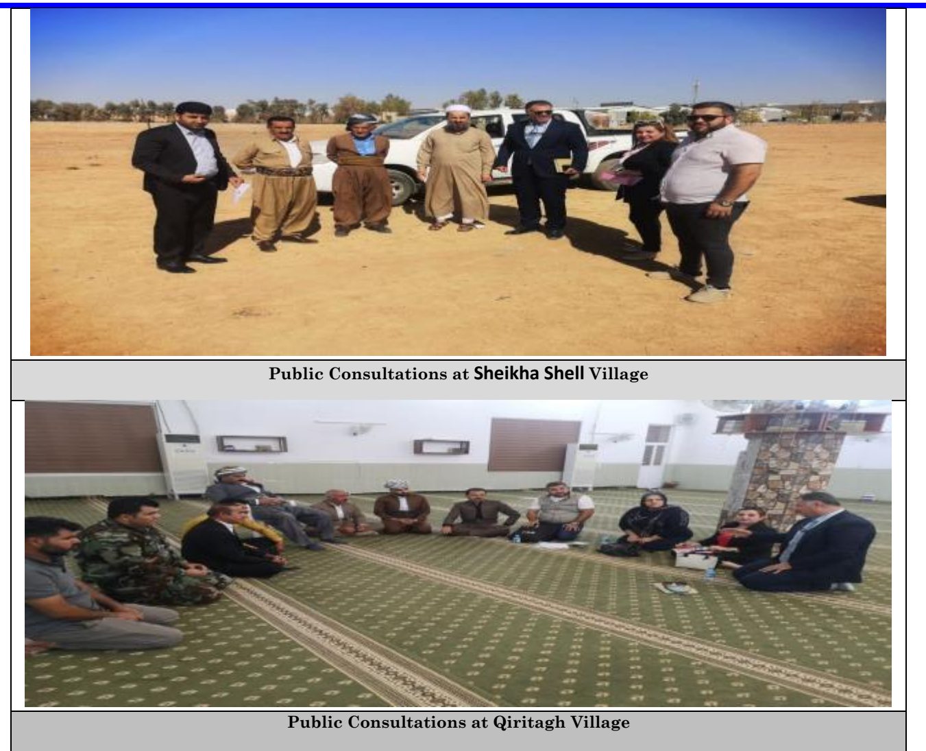
ANNEXES Annex 1: Consultations Photos