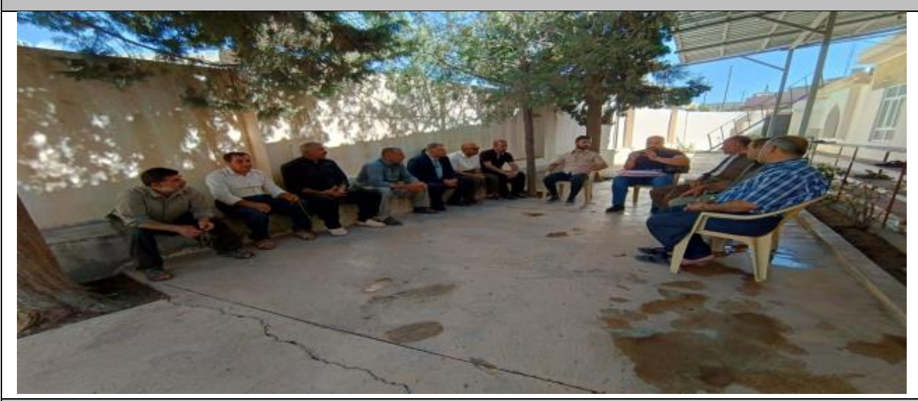
Public Consultations at KARAW Village