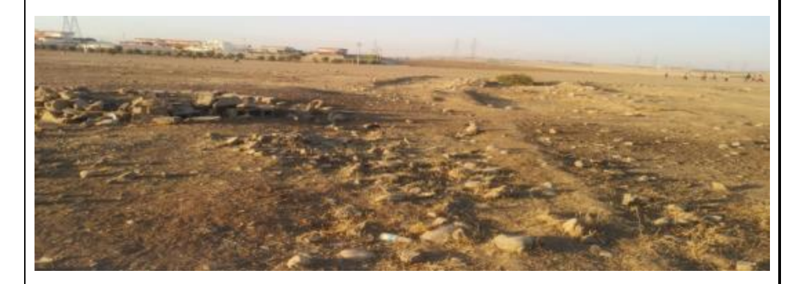
KARAW / for school