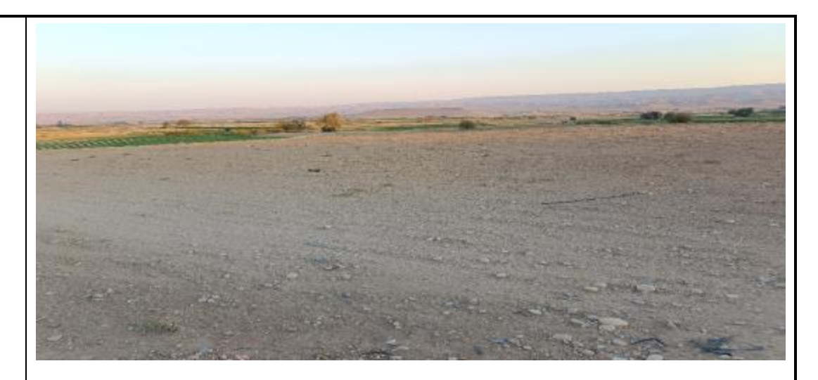
SIKANI / for school