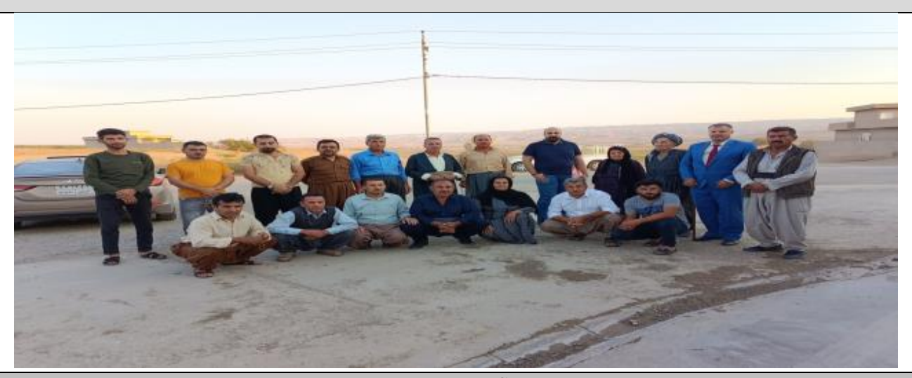
Public Consultations at SIKANI Village