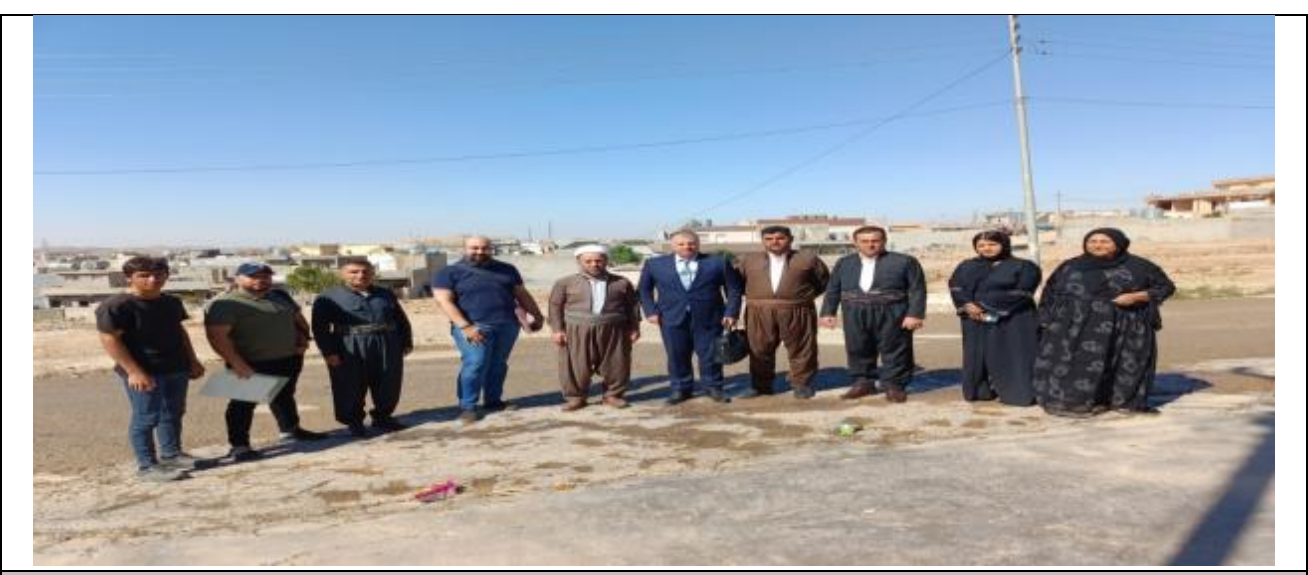
Public Consultations at SIWAKA Village