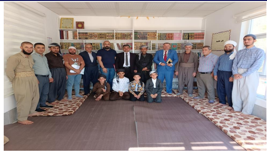
Public Consultations at KHATI Village