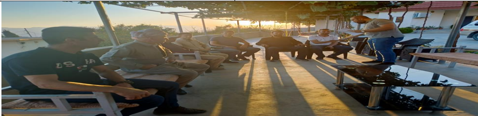
Public Consultations at HUSTAN Village