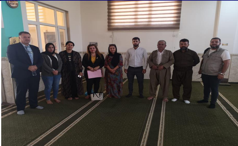
Public Consultations at BAGHEMRA SHIHAB Village