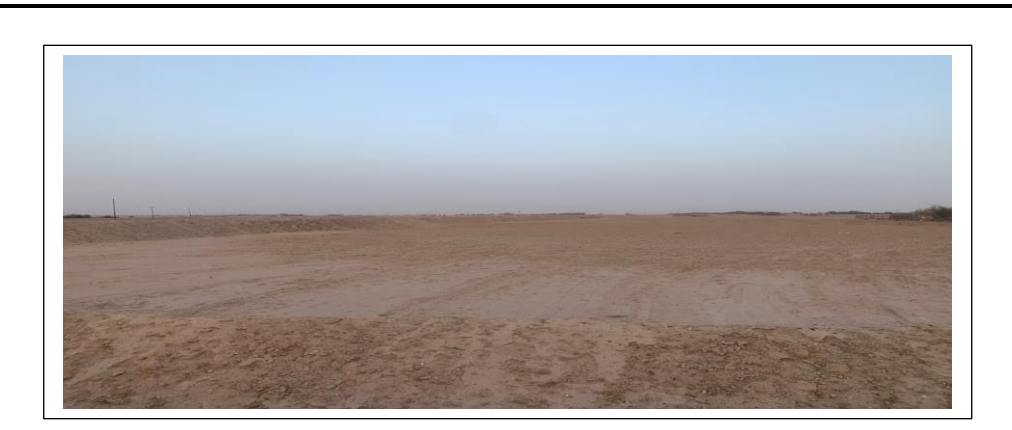
Al-Tamim/ for school