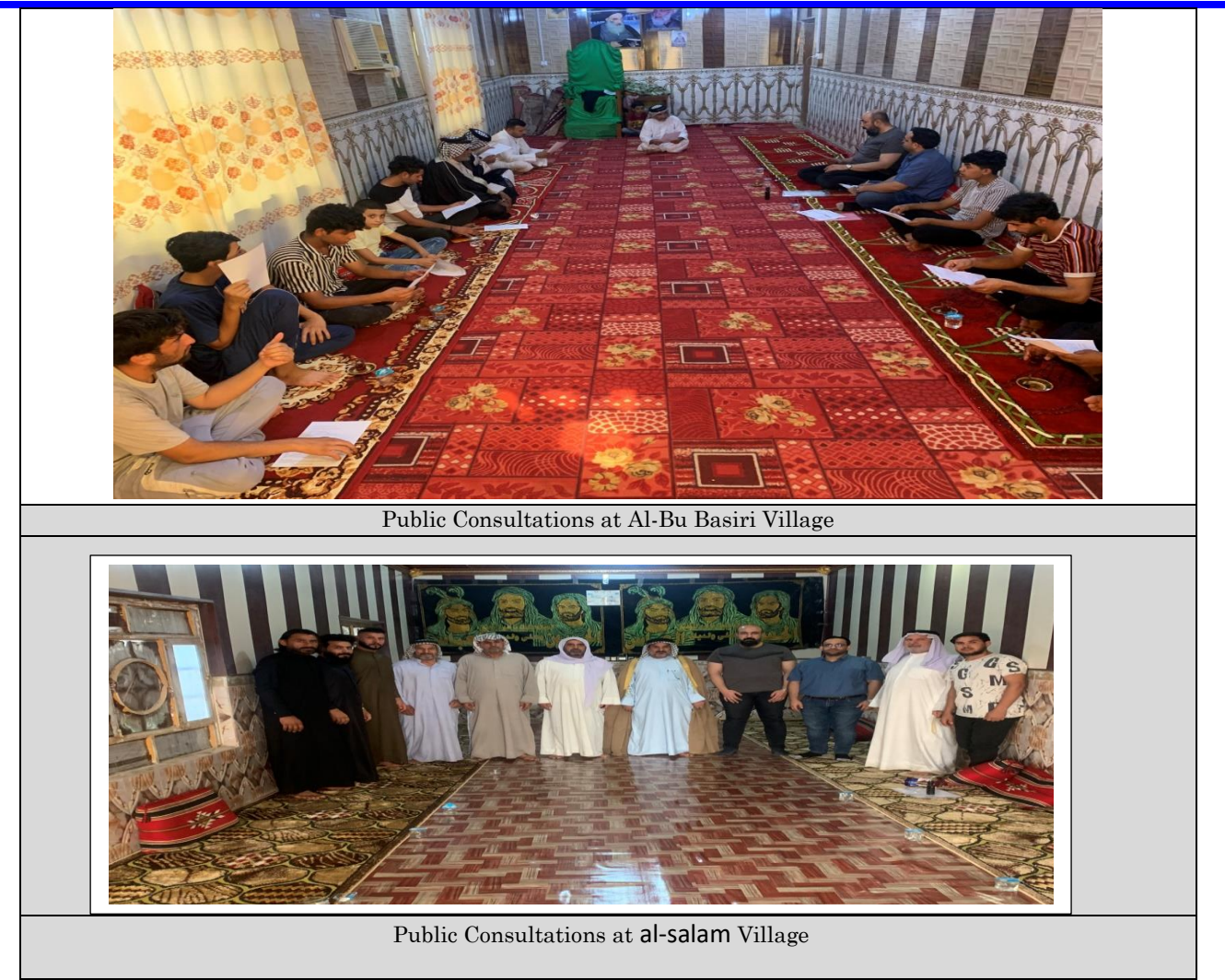
ANNEXES Annex 1: Consultations Photos