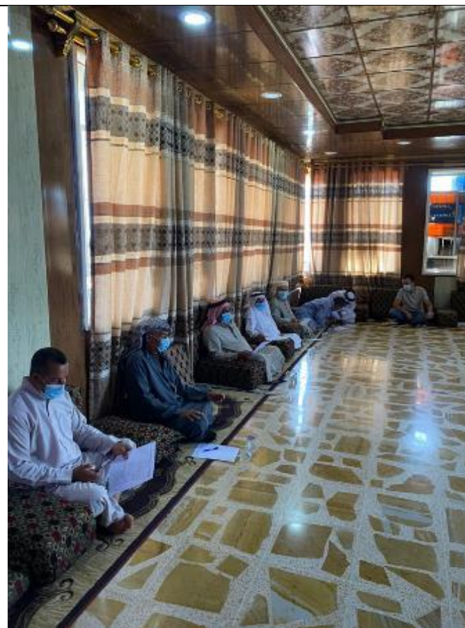
Public Consultations at THRIKARAH Village