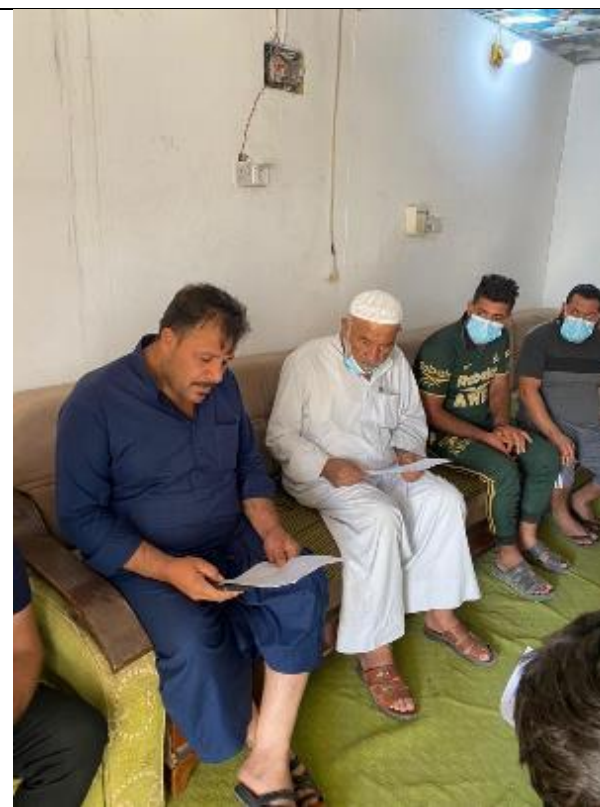
Public consultations at ALIRASH village