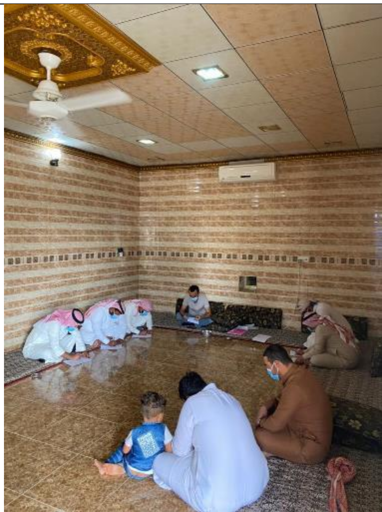
Public consultations at ALAASHIQ village