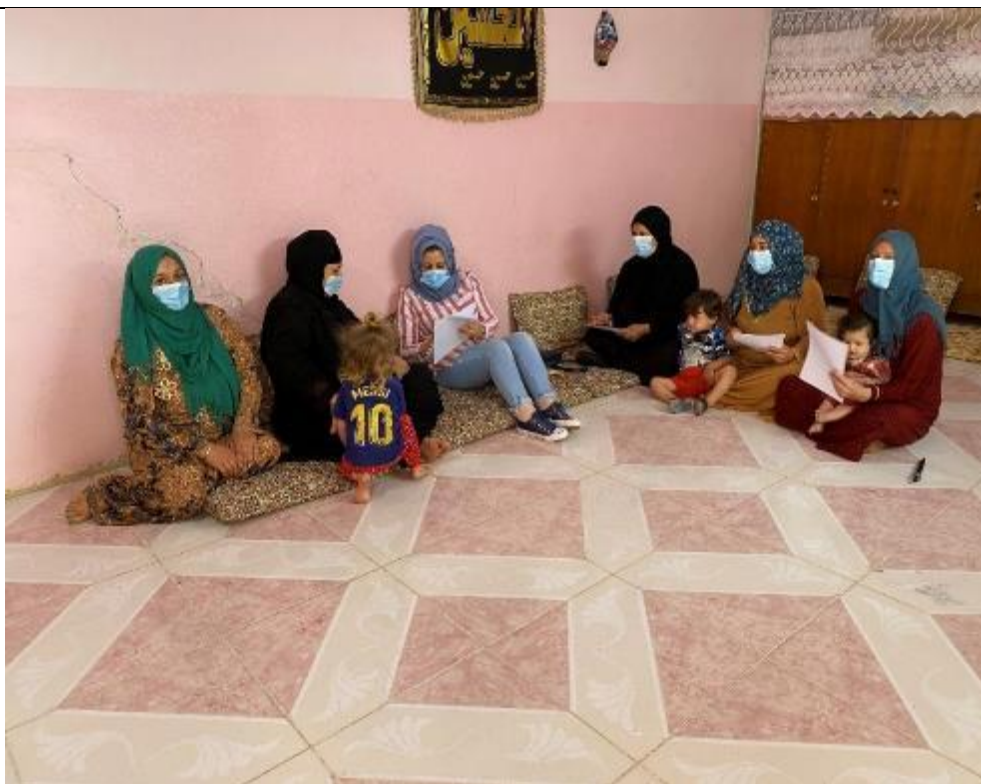
Public Consultations at SHAQULI Village