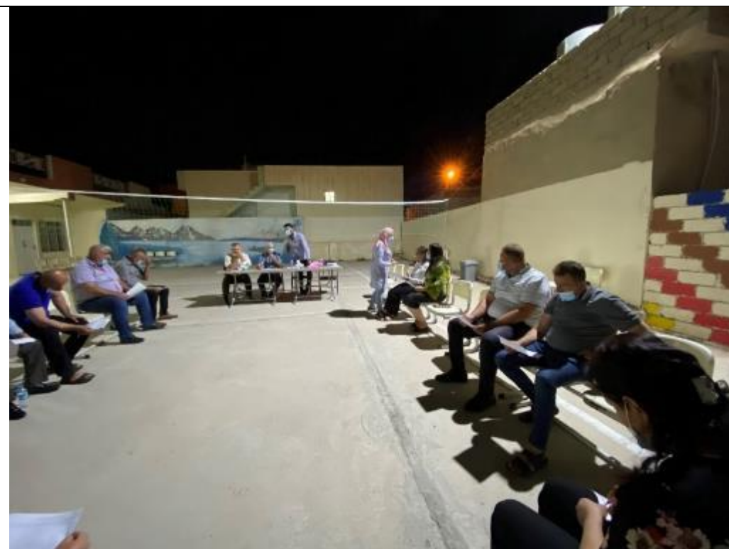
Public consultations at BATNAYA village