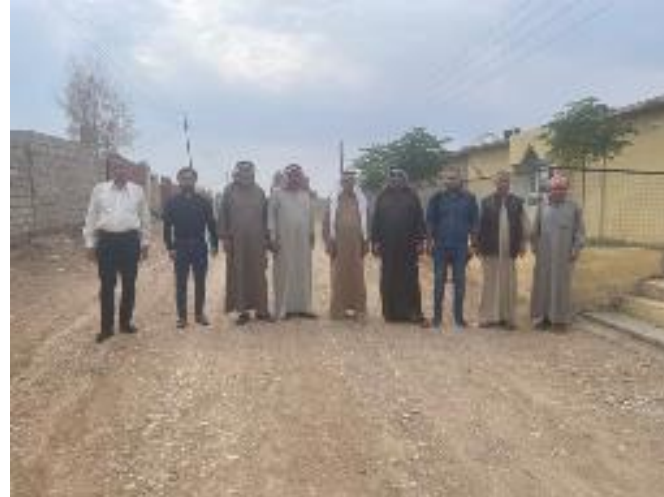
Public consultations at MUJAMAA ALSOFIA