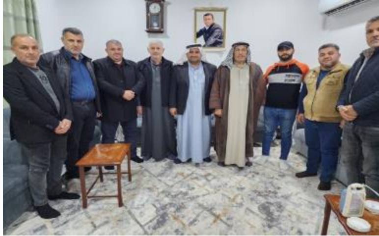
Public consultations at SHEREKHAN AL-SUFLA