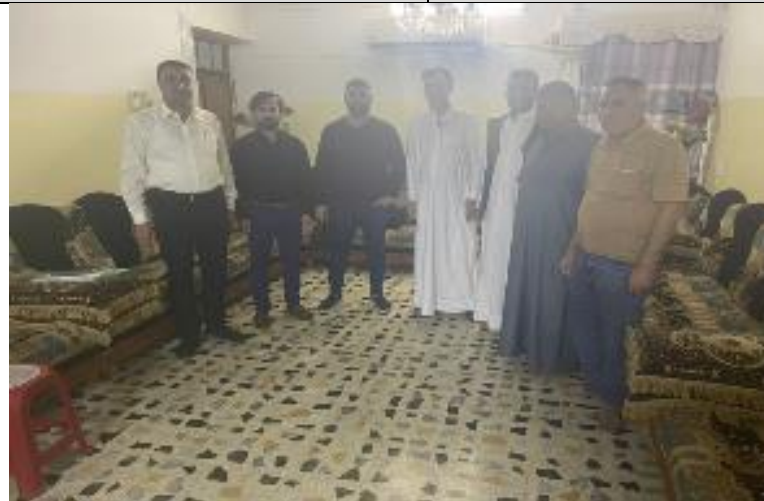
Public consultations at KHARABA KABIRA OULA