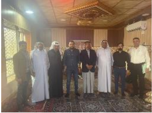
Public consultations at ATMARAT