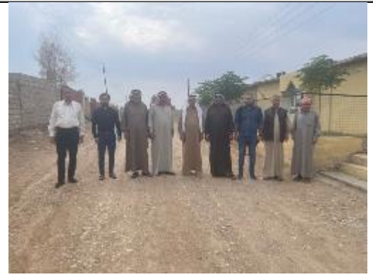
Public consultations at MUJAMAA ALSOFIA