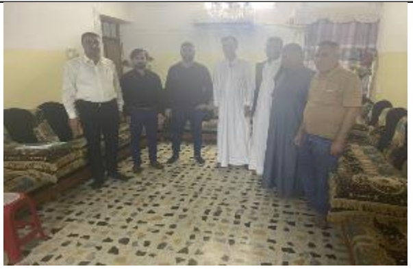
Public consultations at KHARABA KABIRA OULA