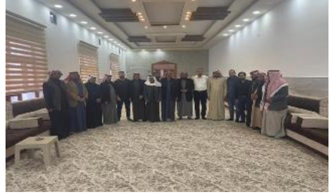
Public consultations at AL-KUBR