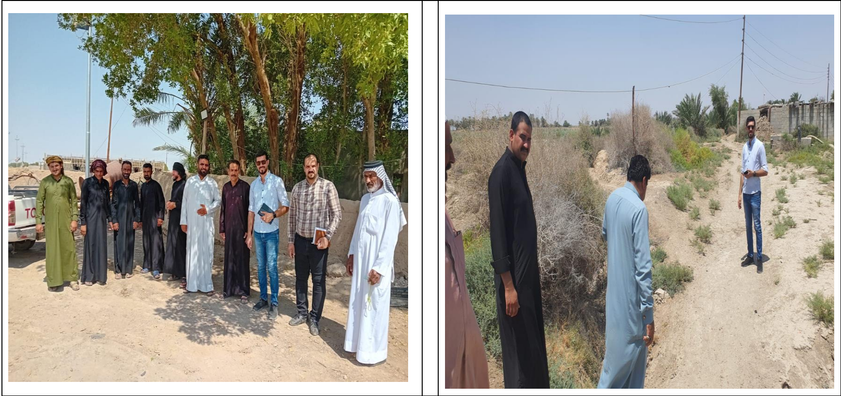
Annex 1: Consultations Photos