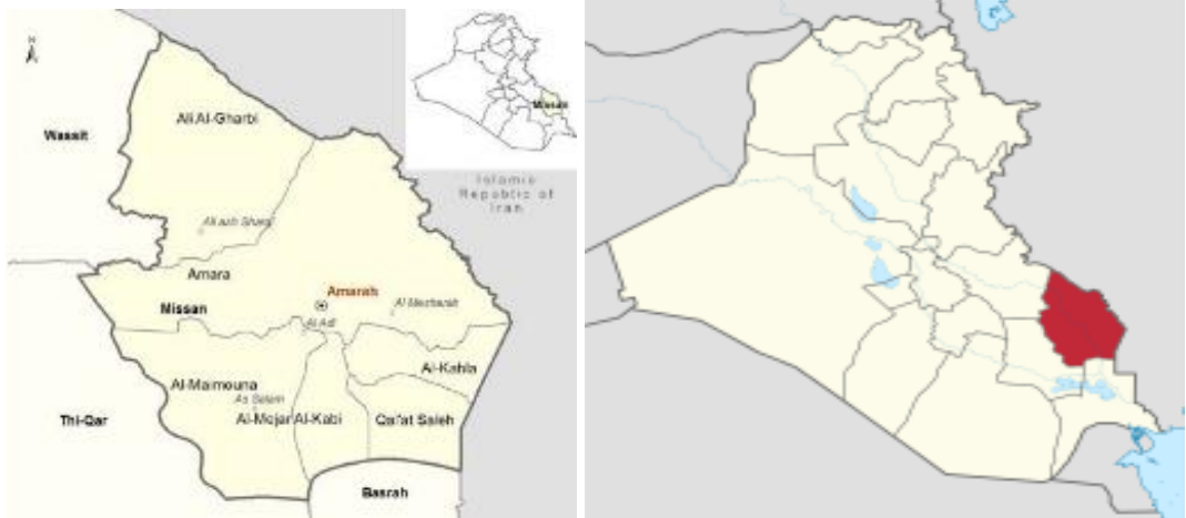
Figure 1: Project Location

The area adjacent to these subprojects' sites are characterized as rural residential and semi desartic to agricultural in some area. There are no protected areas or endangered species (there is no critical or high biodiversity values that might be affected) in the vicinity of the sites. There are no close sensitive receptors located to the subprojects site. The subprojects will improve the transportation infrastructure in these villages by providing asphalt surface to facilitate transport for local communities and road users. Moreover, the road will help the students to go to their schools easily. It important to mention that these roads are within the villages as a network, therefore the other roads can be used as alternative roads.