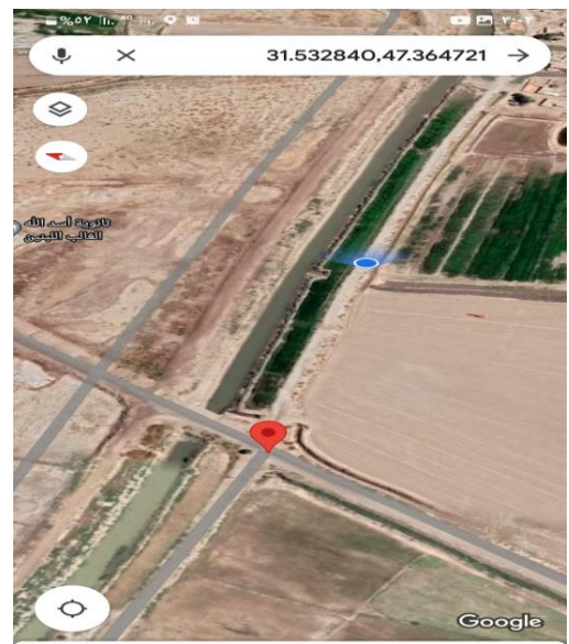
Roads in Al-Tolaibat