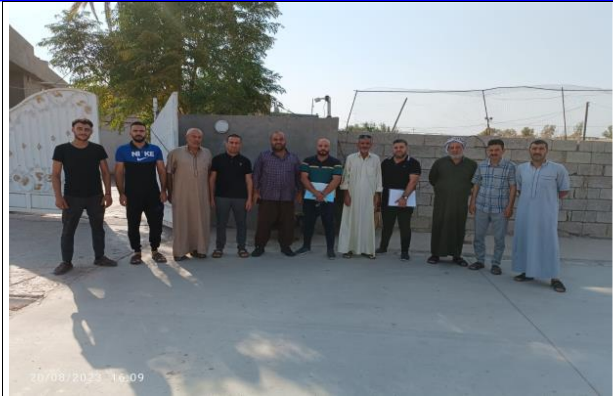
Public Consultations at Jardaglo Village