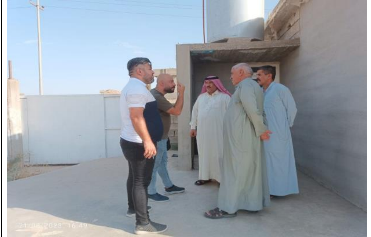
Public Consultations at SHAMEET Village