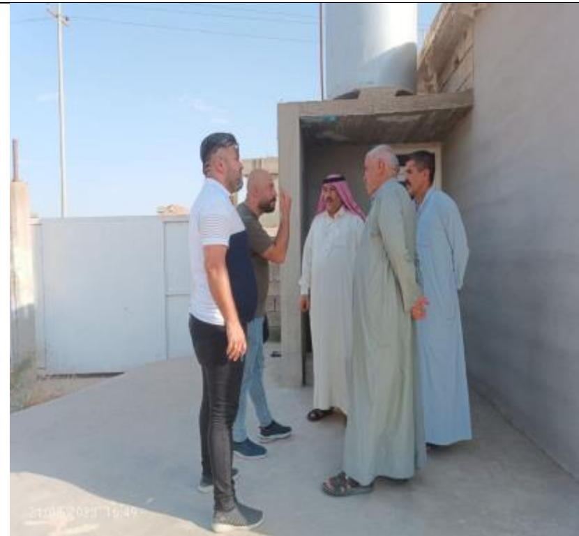
Public Consultations at Shameet Village