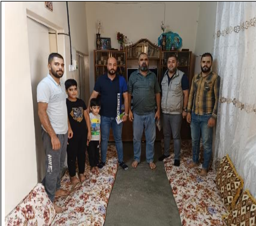
Public Consultations at Imam zain alabedin Village