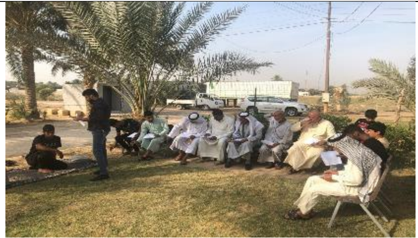
Public Consultations at AL-MAHBOBIA Village