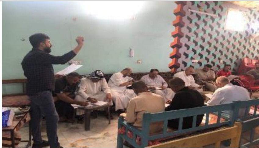
Public Consultations at AL-HAD MIKSAR Village