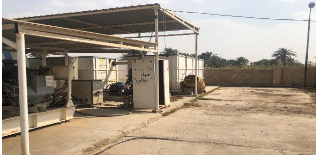
AL-HAD MIKSAR Village