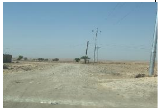
Roads in Ashtokan