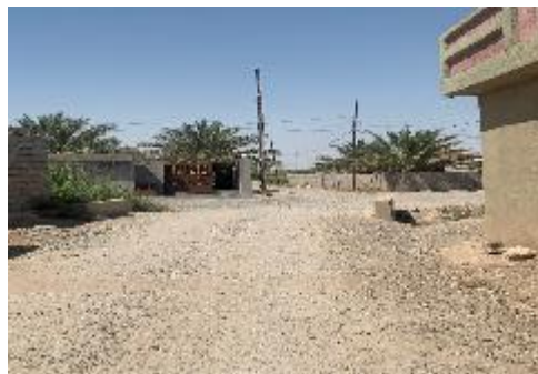
Roads in Al-Qalaa

The area adjacent to these subprojects' sites are characterized as rural residential and semi desertic to agricultural in some area. There are no protected areas or endangered species (there is no critical or high biodiversity values that might be affected) in the vicinity of the sites. There are no close sensitive receptors located to the subprojects site. The subprojects will improve the transportation infrastructure in these villages by providing asphalt surface to facilitate transport for local communities and road users. Moreover, the road will help the students to go to their schools easily. It important to mention that these roads are within the villages as a network, therefore the other roads can be used as alternative roads.