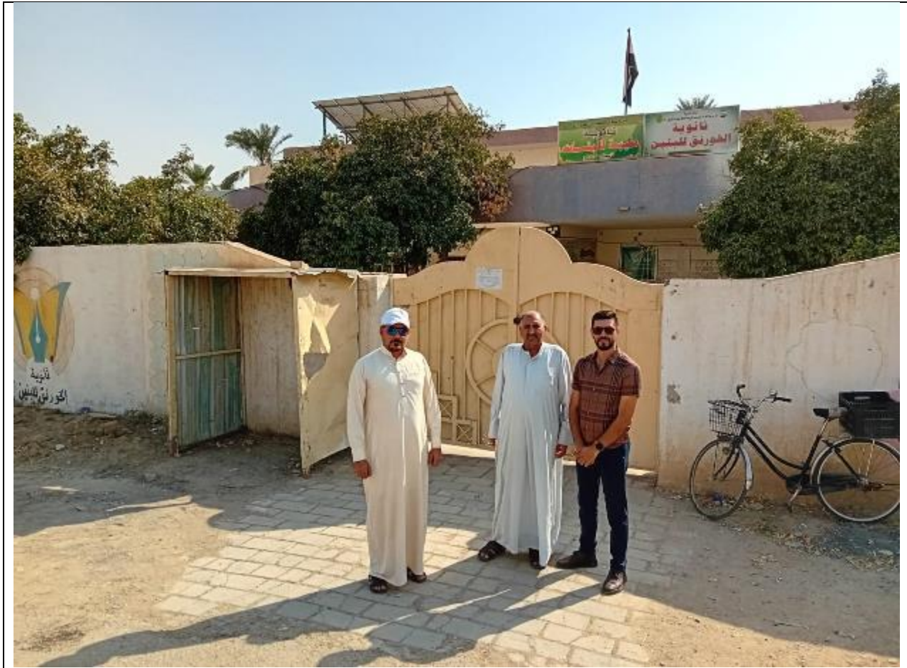
Public Consultations at AL-ABAYACHI Village