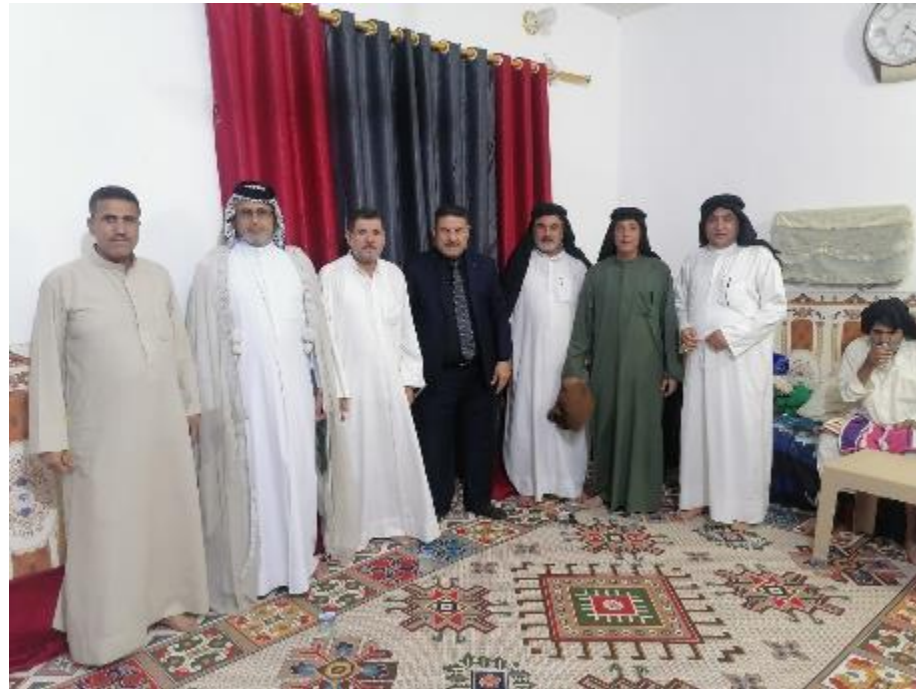
Public Consultations at VILLAGE 6 Village