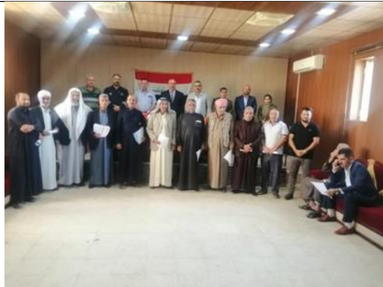
Public Consultations at BALWA Village