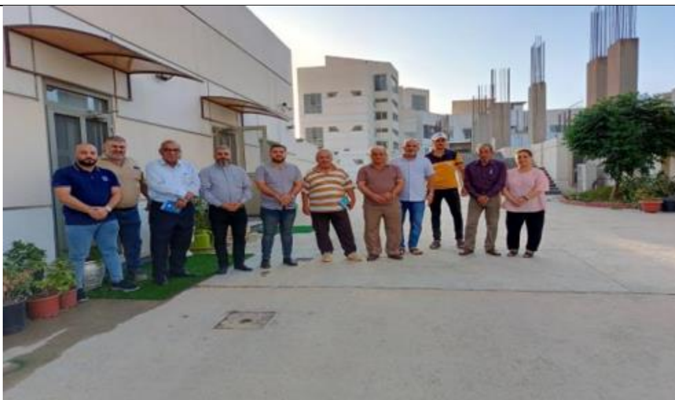
Public Consultations at SIKANYAN Village