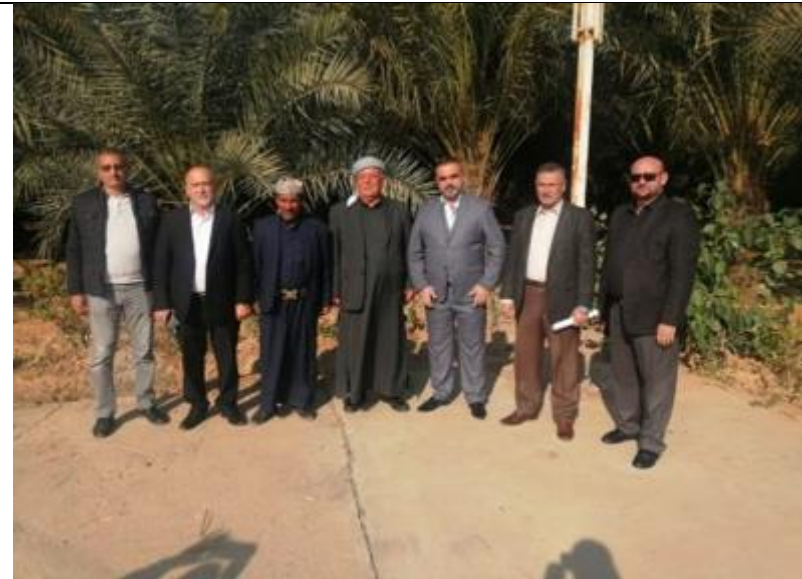
Public Consultations at TURKLUAN Village