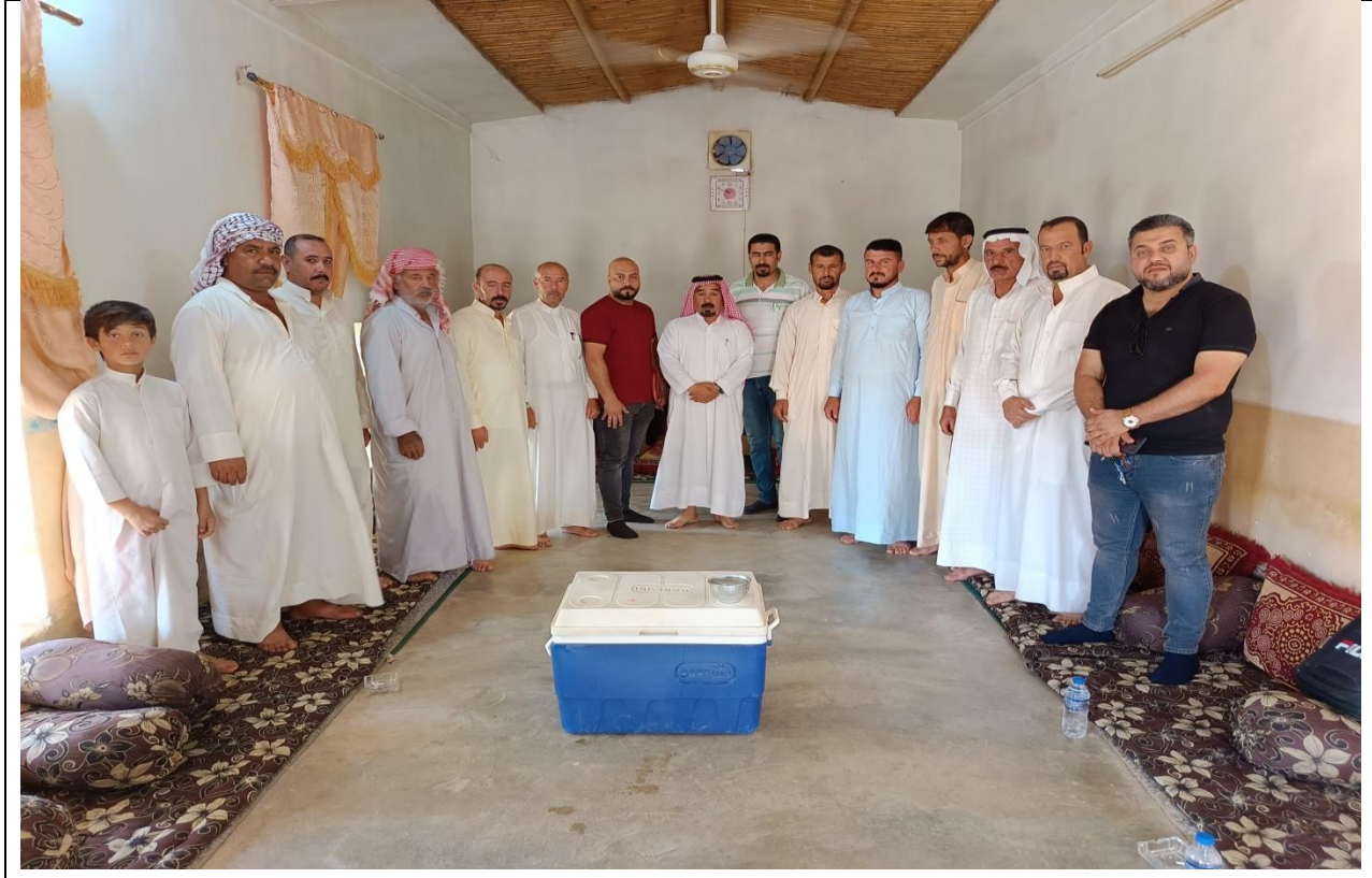
Public Consultations at almakam