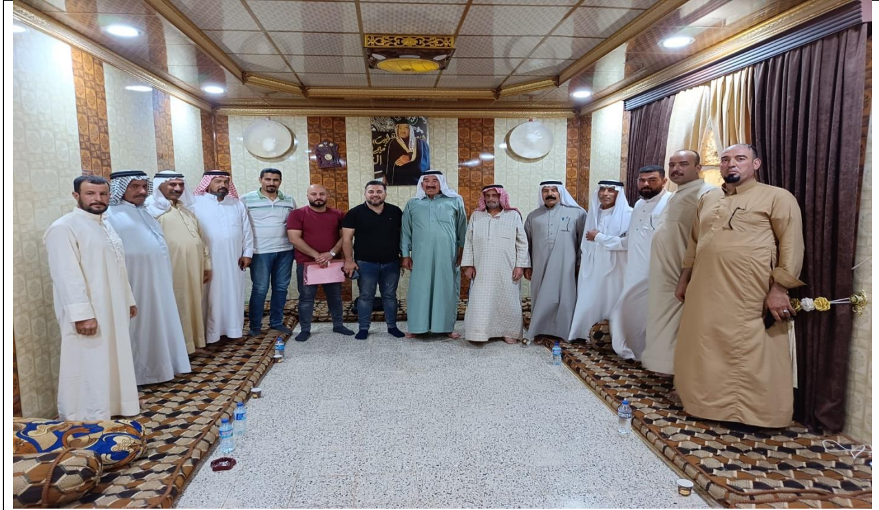
Public Consultations at godida al-sadahVillage