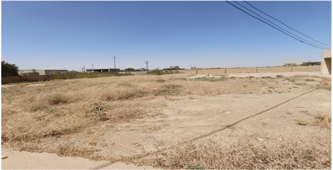
Sidr Al-Nahr / school