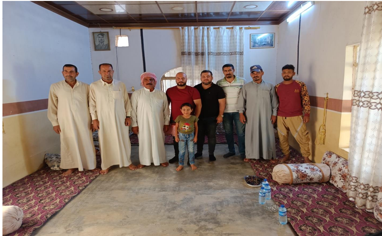
Public Consultations at Sidr Al-Nahr Village