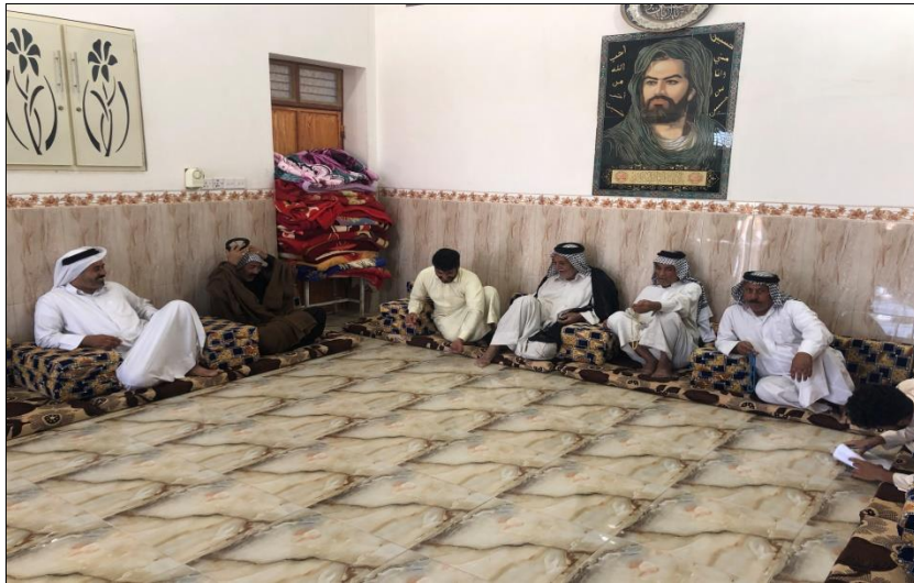
Public Consultations at Al-Maleh Village