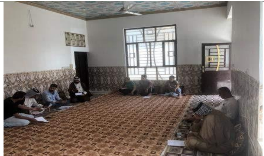
Public Consultations at Al-Dukhanya Al-Gharbia 2 Village