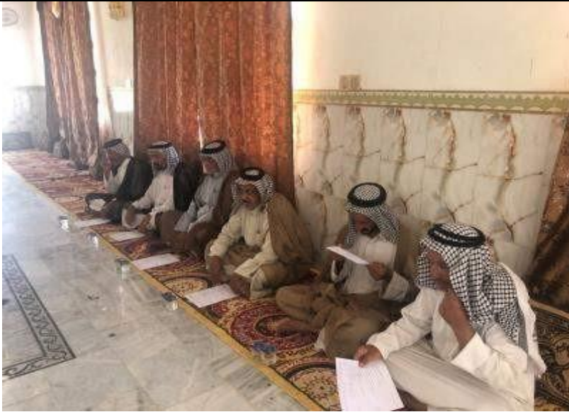
Public Consultations at Um Halal 2 Village