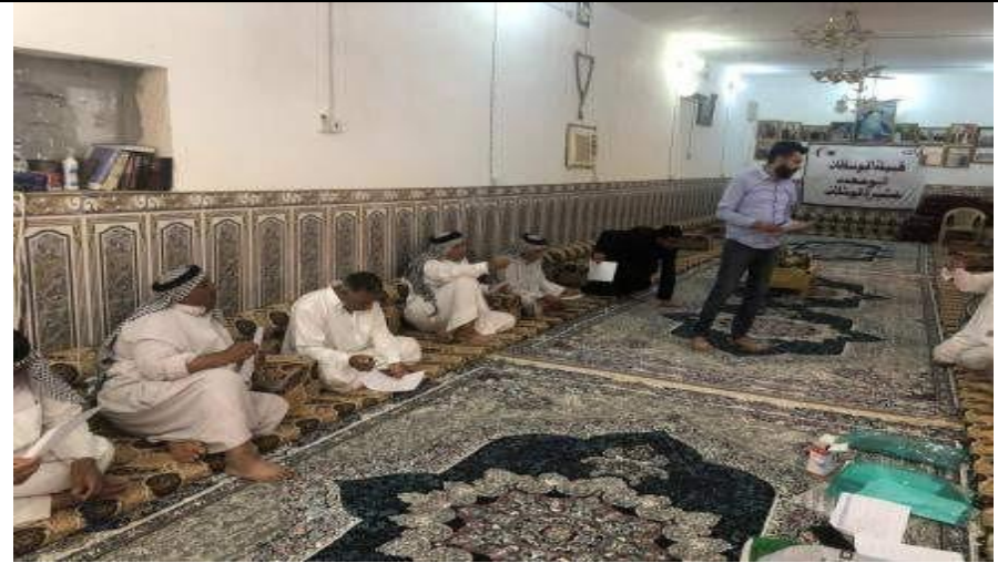
Public Consultations at Al-Boshlash Village