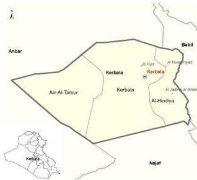
Figure 1: Project Location and layout

The area adjacent to the subproject’s sites are characterized as rural residential and semi desertic in some areas. The subprojects are located within the residential part of the area. There are no protected areas or endangered species (there are no critical or high biodiversity values that might be affected) in the vicinity of the site. There are no close sensitive receptors located near the subprojects site. The subproject aims to: