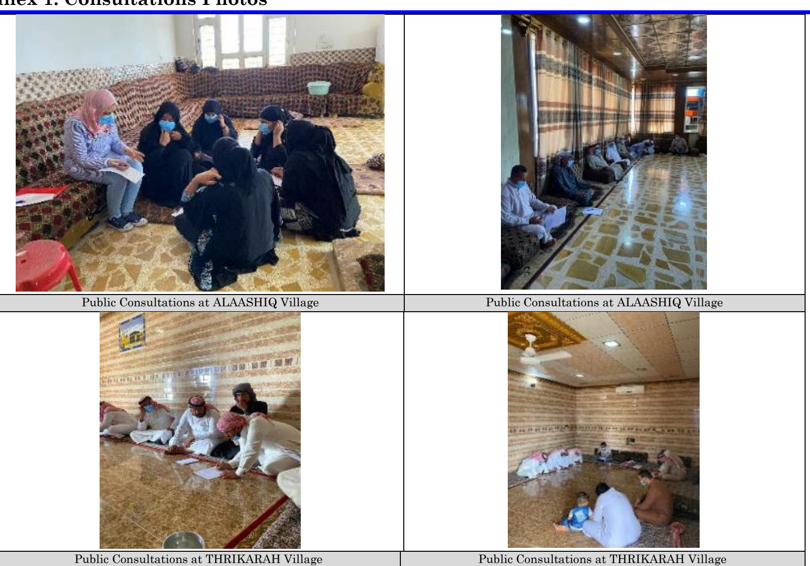
Annex (2): Sample individual interviews for both men and women