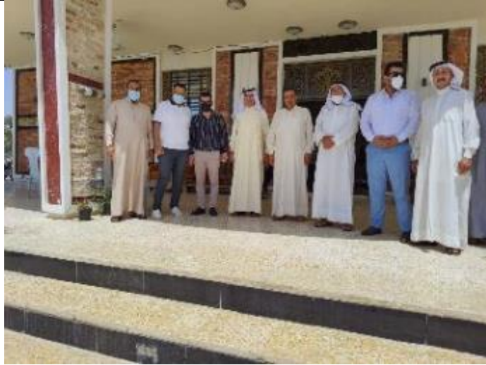
Public Consultations at Abu Sedira Village