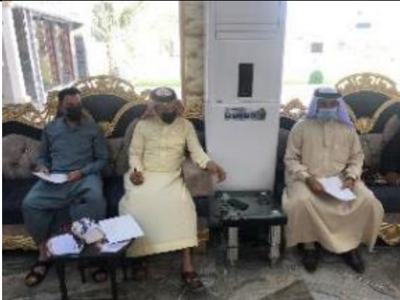
Public Consultations at Albu Hatem Village