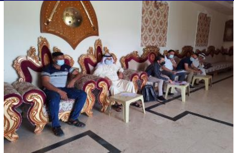
Public Consultations at Abu Sedira Village