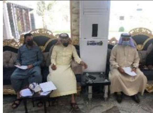
Public Consultations at Albu Hatem Village