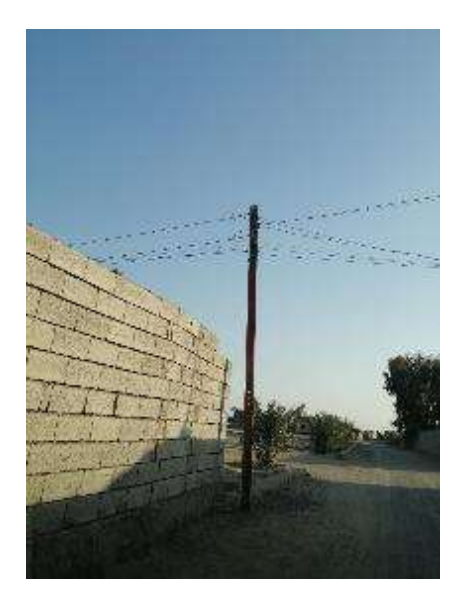
Figure 2: Current Situation at this Village

The subprojects will improve the electricity distribution networks, increase the flexibility of providing electricity and therefore providing electricity to schools and other simple daily activities, and will support mitigating the effects of war to attract displaced citizens to their village.