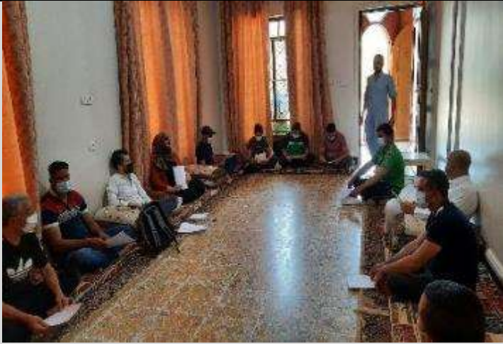
Public Consultations at ABU- FLEES Village