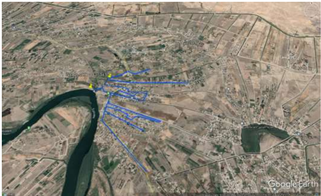
Compact water unit and it's network at the END OF THE ALBU BALI