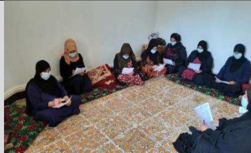
Public Consultations at ABU- FLEES Village