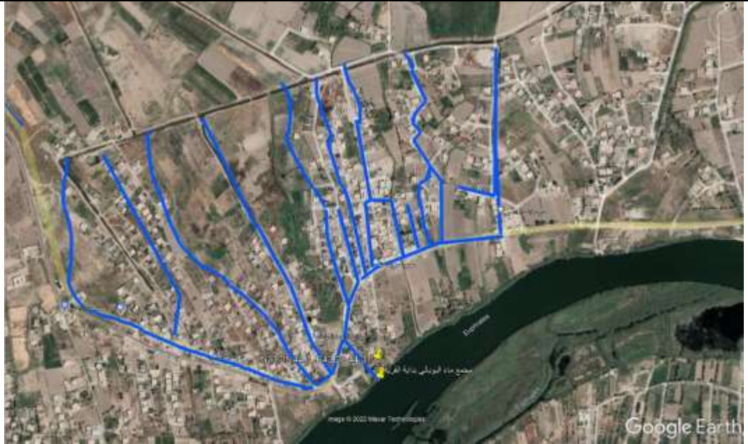
Compact water unit and it's network at the BEGINNING OF THE ALBU BALI